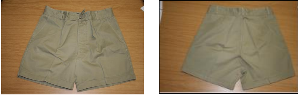
Image 12: Field shorts, (Front view left photograph and back view right photograph.)