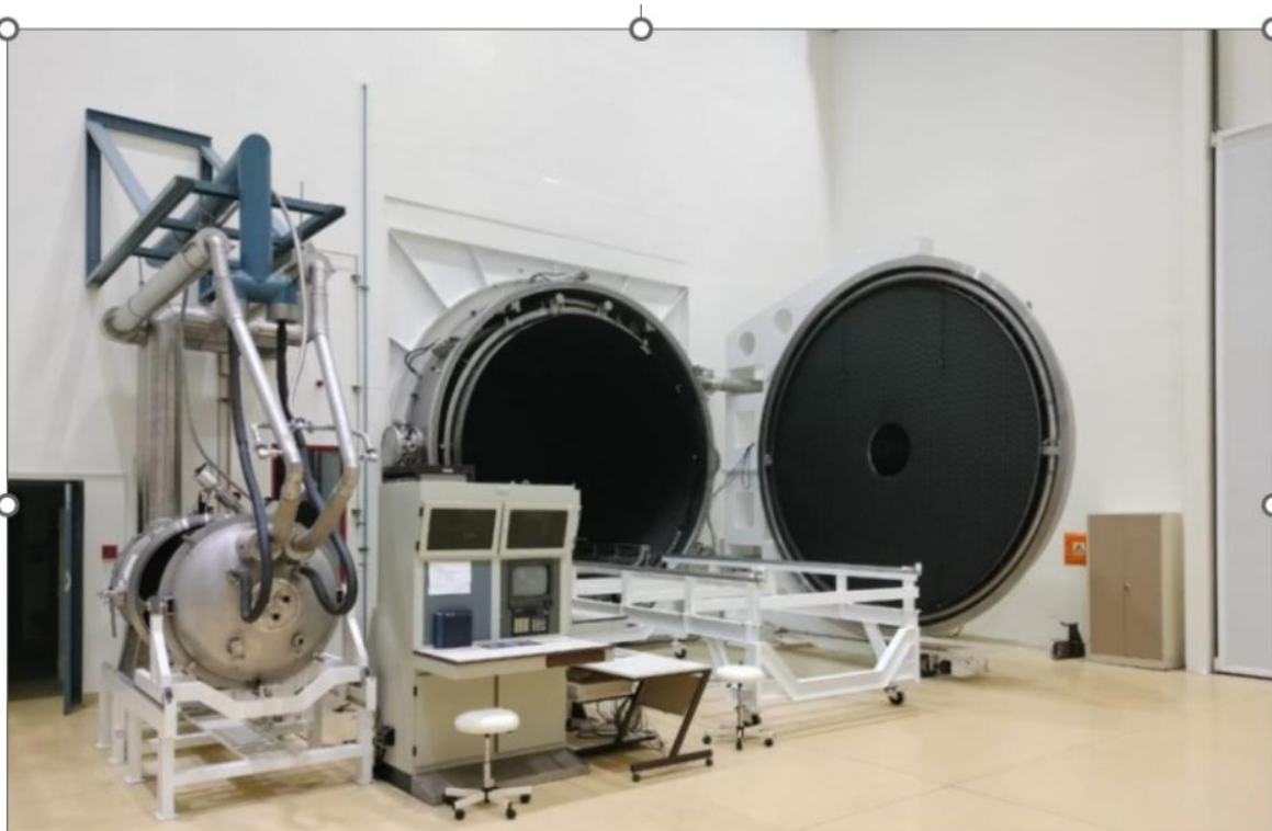
Figure 1. Photo of the Large TVC (L-TVC) and the Medium TVC (M-TVC)

The Data Acquisition and Control system is currently obsolete and will require replacement.