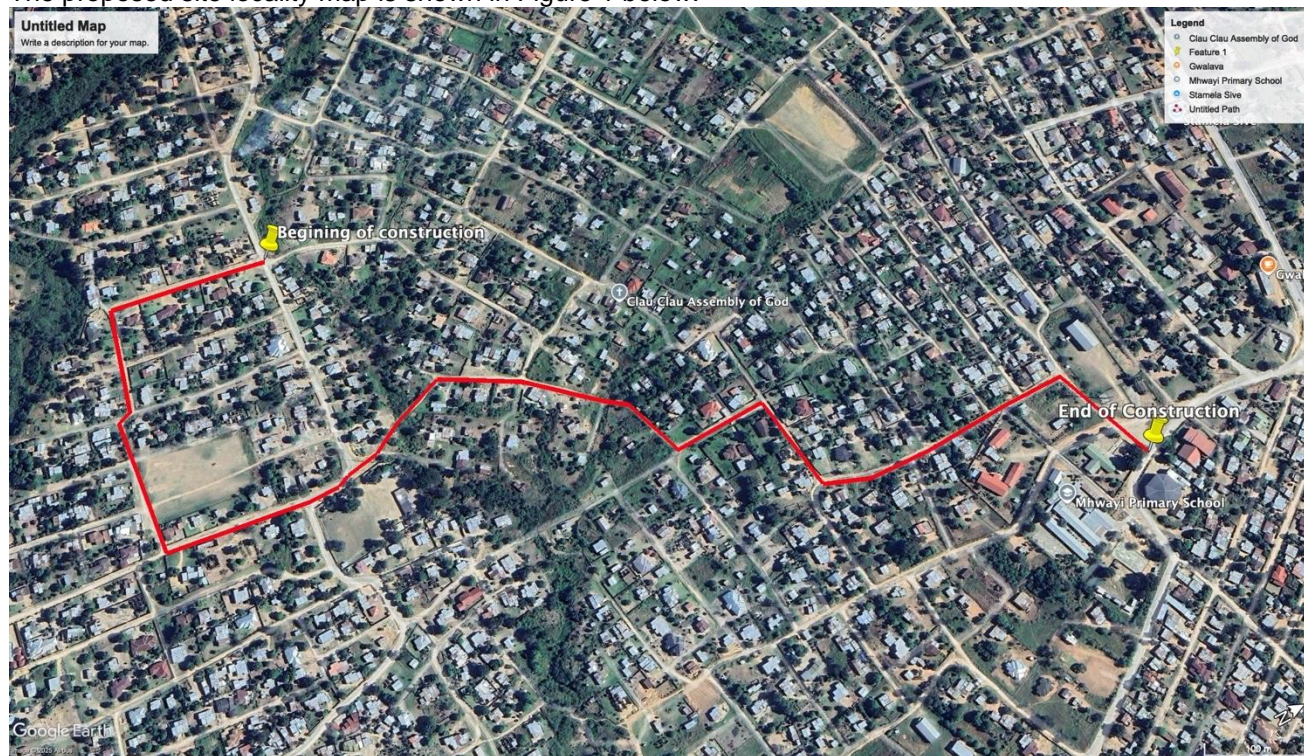
Figure 1: Locality Plan of the Project Area

The proposed site locality map is shown in Figure 1 below.