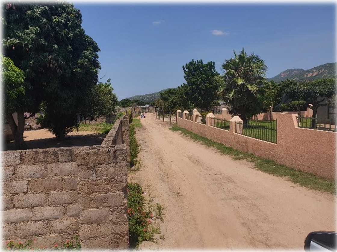
Figure 3 – Narrow road width, boundary walls to be relocated