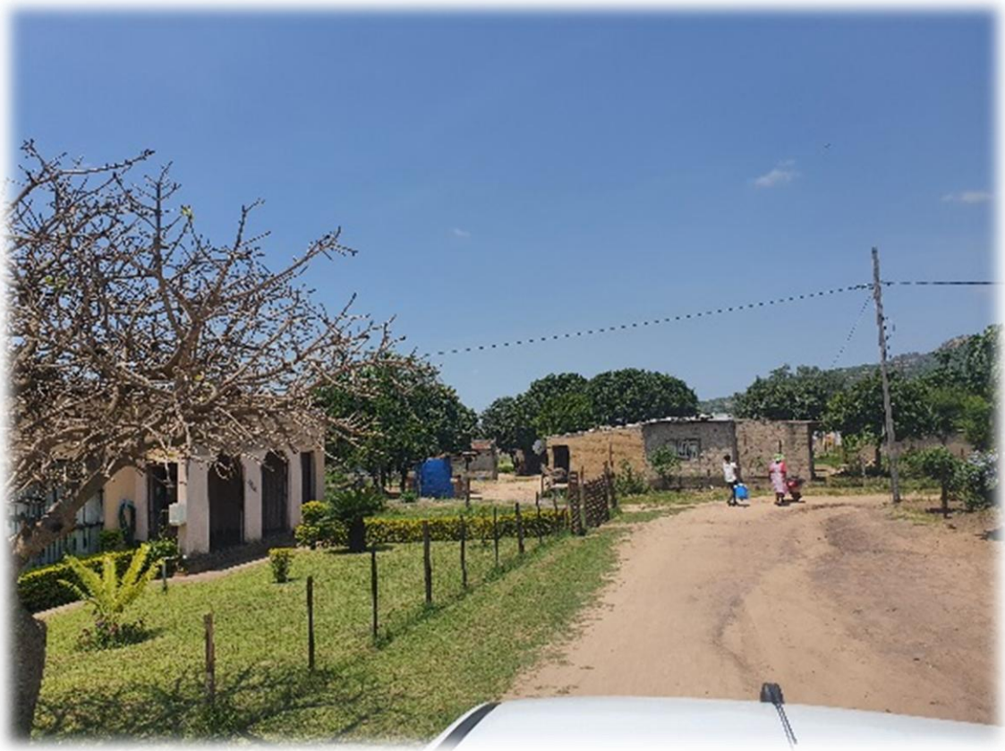
Figure 5 – End of construction