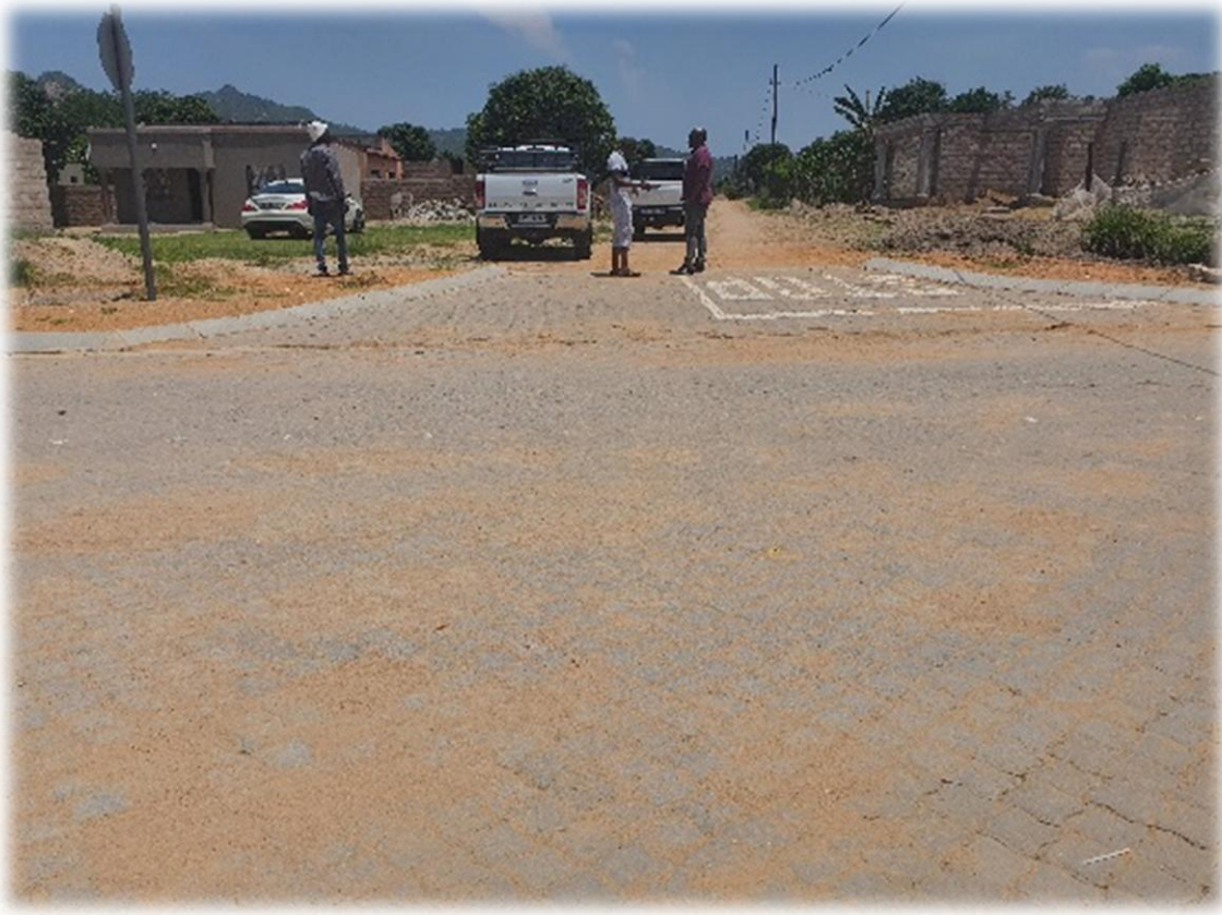
Figure 2 – Narrow road width, boundary walls to be relocated.