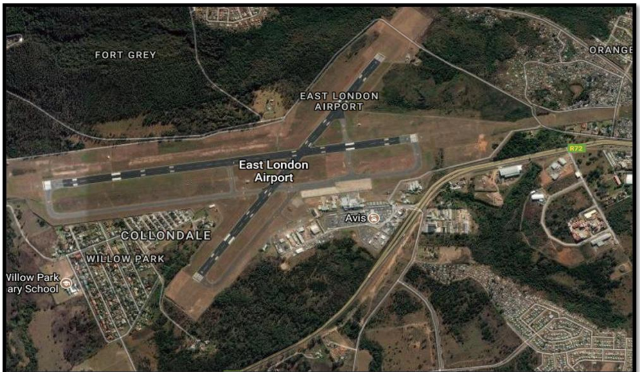
Figure 1: Locality map of the KPA airside precinct