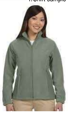
Sample poly fleece jacket