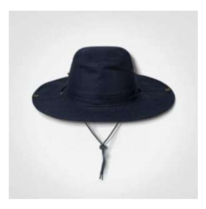
Sample Bush hat