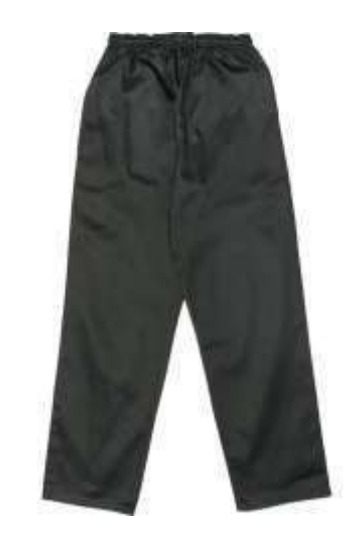
Sample picture of the Chef's Trouser