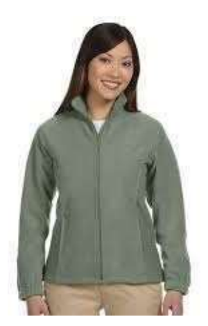
Sample poly fleece jacket