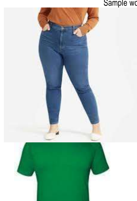
s for females