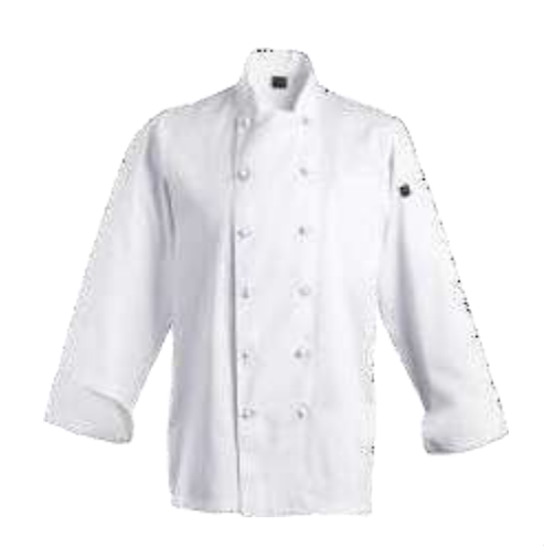
Sample picture of the Chef's top