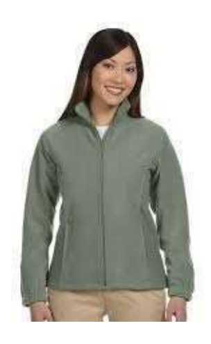
Sample poly fleece jacket