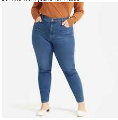
High waist /Mom Jeans for females