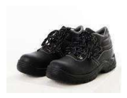
Sample Safety boots