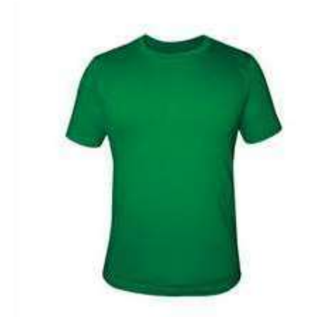
T/Shirt sample picture