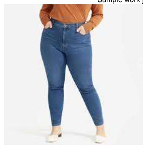
High waist /Mom Jeans for females