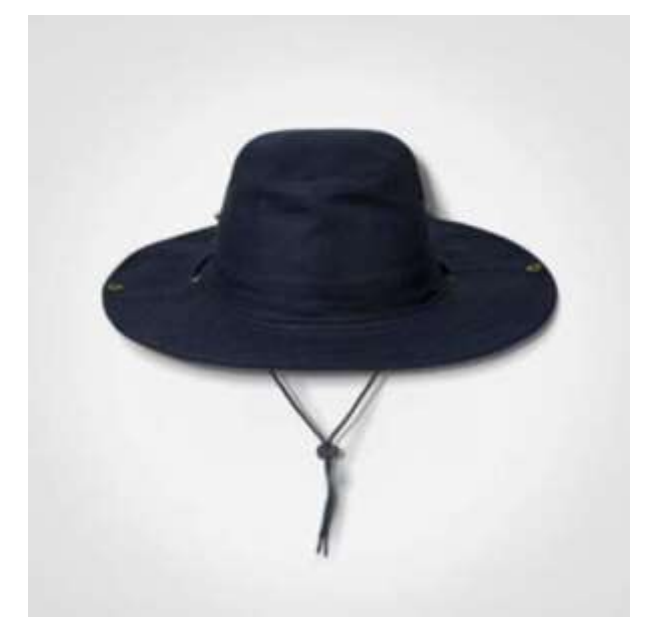
Sample Bush hat