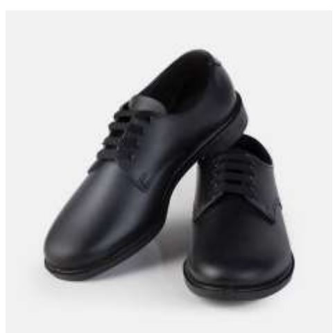
Sample picture of Black School Shoes