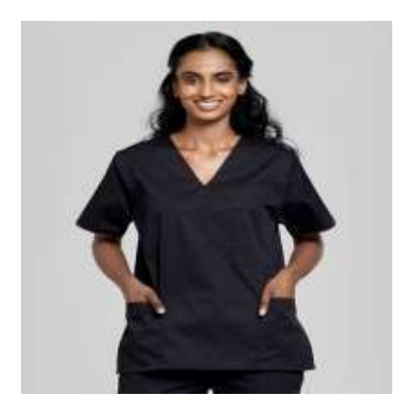
Sample picture of the beauty and therapist top (Scrub)