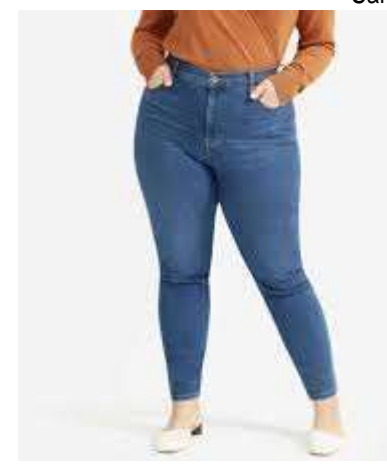
s for females