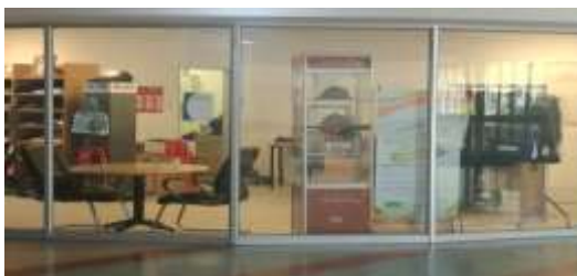
Corporate Gifts shop