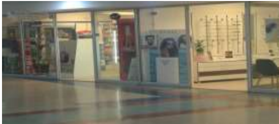
Pharmacy & Optometrist