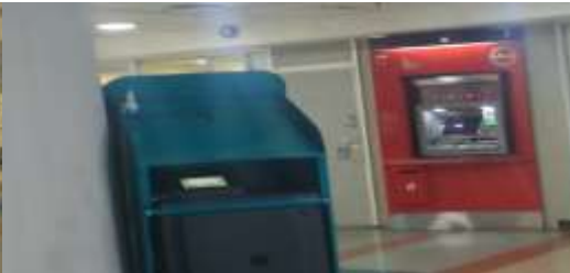
ABSA & FNB – ATM