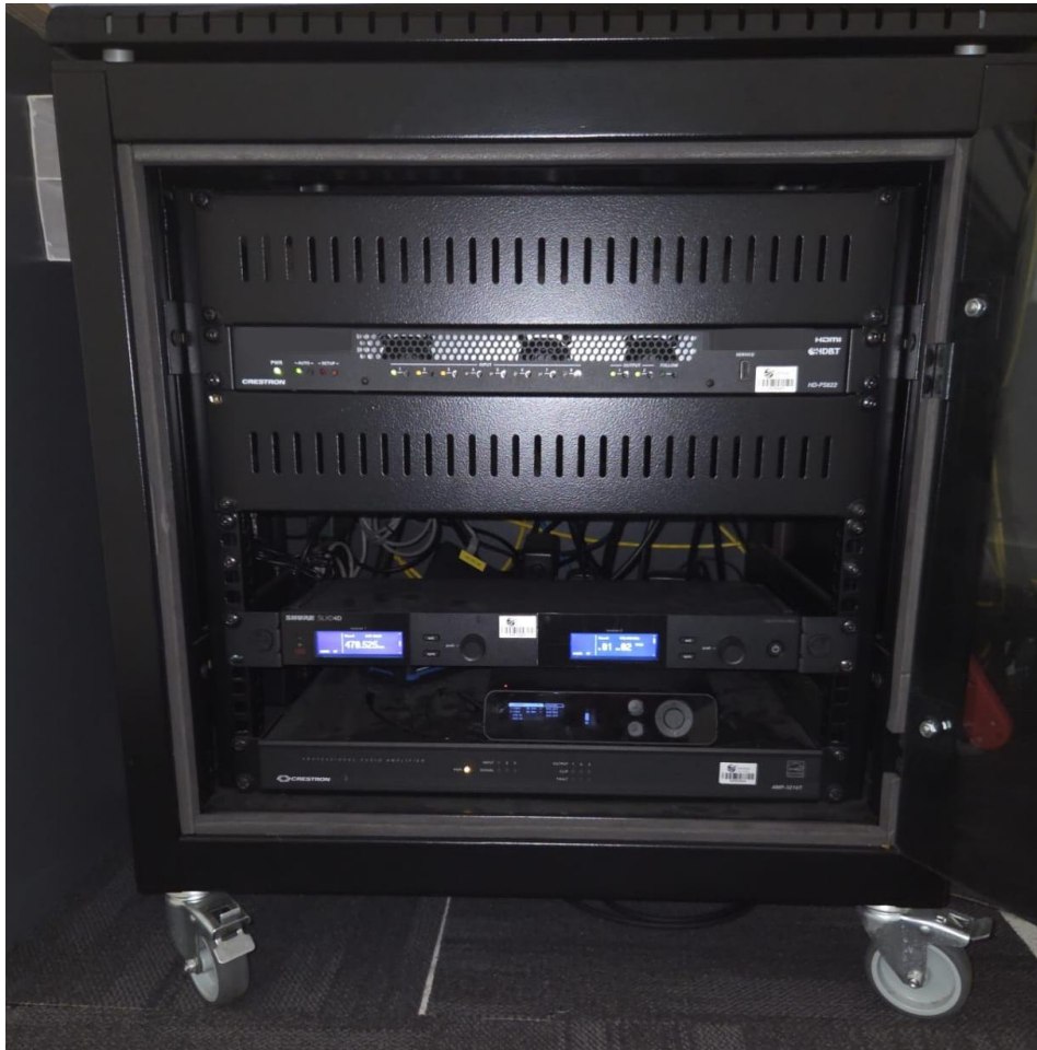
Figure 2 Cabinet with Audio / Visual Equipment