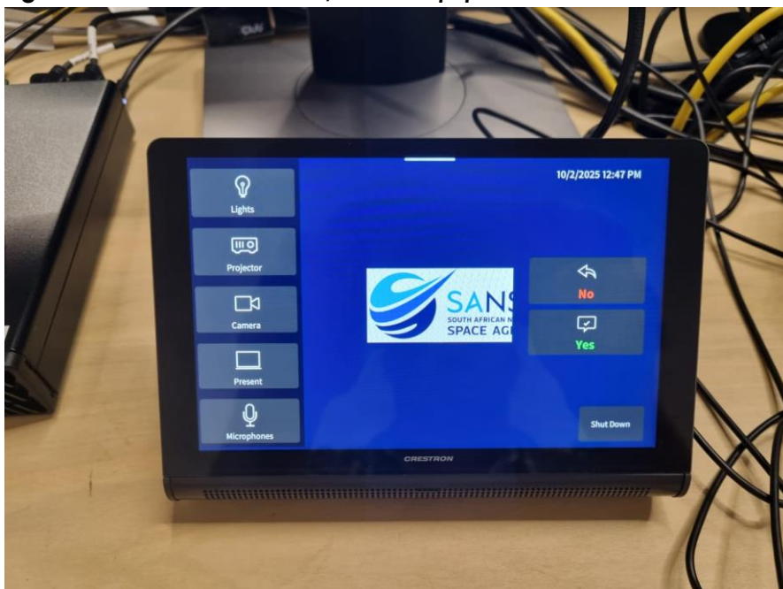
Figure 3 Crestron Touch Display