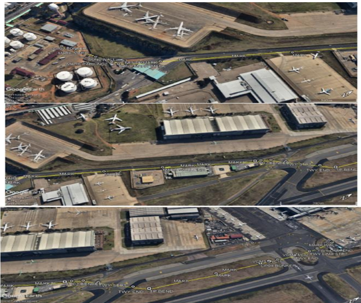
Figure 1: The feeder line route from fuel depot to valve chamber VCM1

Tel +27 11 723 1400 Fax +27 11 453 9354 Western Precinct, Aviation Park, O.R. Tambo International Airport, 1 Jones Road, Kempton Park, Gauteng, South Africa, 1632 P O Box 75480, Gardenview, Gauteng, South Africa, 2047 www.airports.co.za