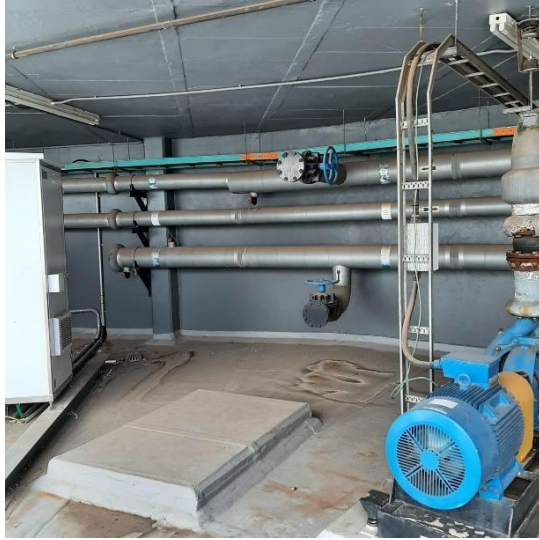
Figure 2: GNIC position on top of Siemens building (physical position)

Neotel datacentre - 26° 0'34.70"S, 28° 7'11.70"E