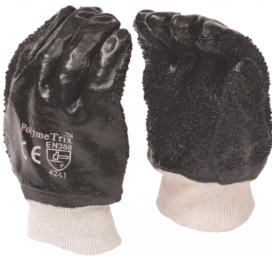
sample picture of the Shutter Proof Gloves