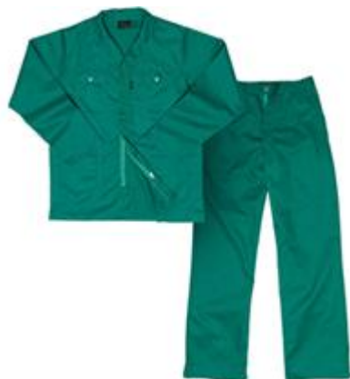
conti suits sample pictures