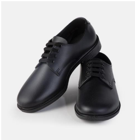
Sample picture of Black School Shoes