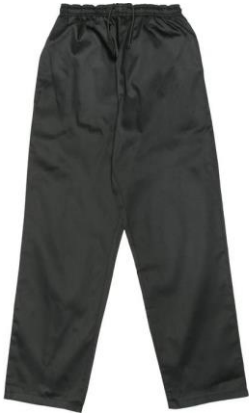
Sample picture of the Chef's Trouser