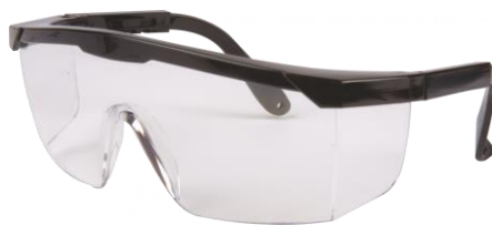
Sample picture of the Safety specs