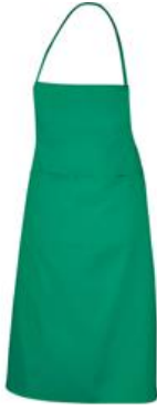
Sample picture of the Dressmaking Apron