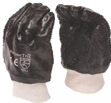
Sample picture of the Shutter Proof Gloves