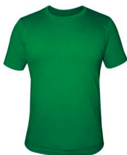
Sample picture of the T-shirt