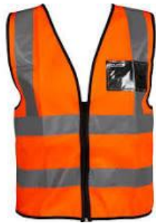
sample picture of the reflective vest