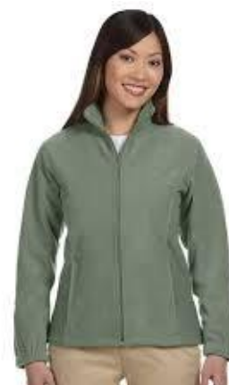
Sample poly fleece jacket