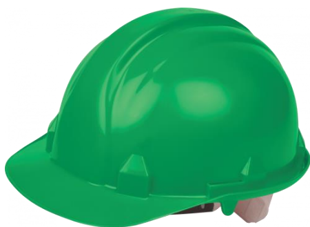
Sample picture of Safety hat