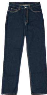
Sample work jeans for males