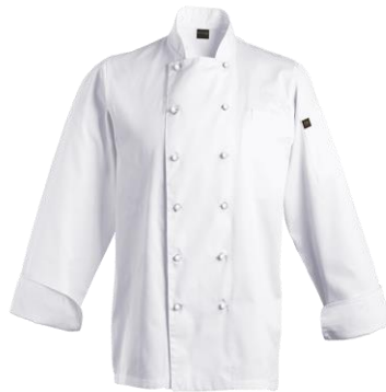
Sample picture of the Chef's top