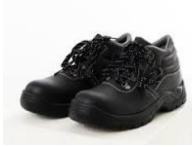
Sample Safety boots