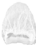
Sample pictures of the chef's hats