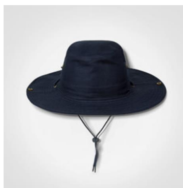
Sample Bush hat