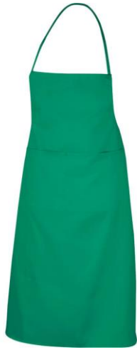
Sample picture of the Dressmaking Apron