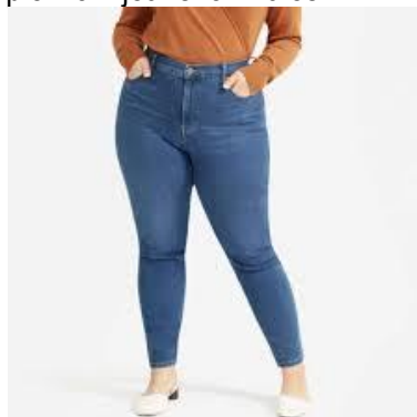
High waist /Mom Jeans for females