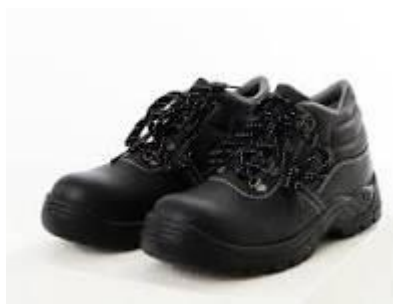
Sample Safety boots

SAMPLE PICTURES of the Personal Protective Clothing indicated above