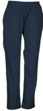
Sample picture of Core Scrub Pants