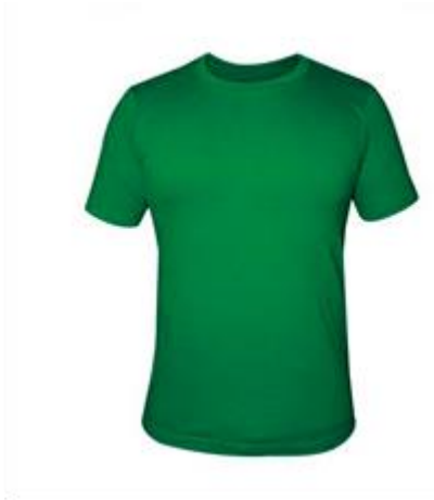
T/Shirt sample picture