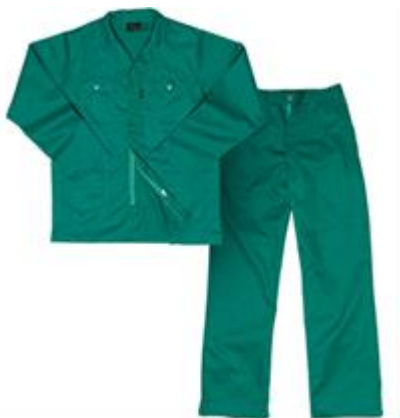
conti suits sample pictures