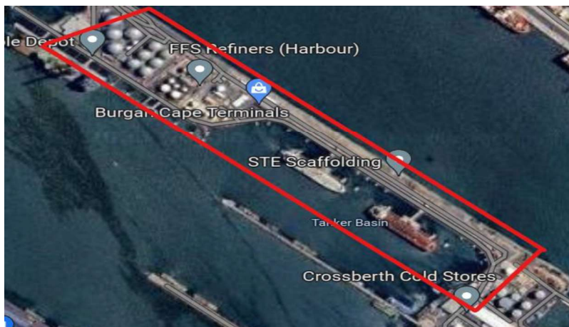
Figure.1 Overview of the Tanker basin plant

The firefighting system situated at the Tanker basin area in the Port of Cape Town is a fully automatic firefighting system that assist the firefighters to fight a fire at tanker berths. The system consists of a fully automatic pumped water supply which maintains the system at the required pressure and delivers the required flow to the firefighting equipment when needed. The pump uses seawater as the medium and the system consists of mild steel piping material for water transfers from the suction point to the delivery point. The pipe system which transfers seawater is about 2700 metres both pipelines combined (Red and Blue piping) from the booster pump station to the delivery point, eastern mole 2 (EM2).