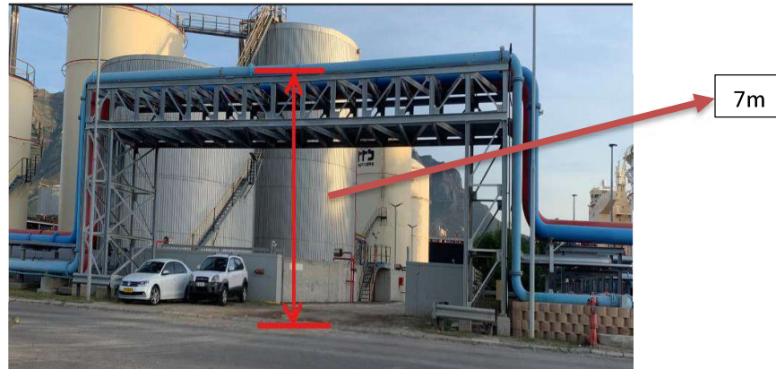
Figure.4 shows a 7m pipe high above the ground surface

Description of the Works: Provision of a once-off Maintenance Pipe Corrosion Coating for a Tanker Basin Firefighting System for Transnet National Ports Authority (TNPA), at the Port of Cape Town.