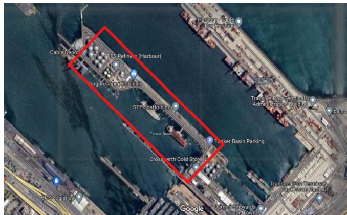
Figure 2. Aerial View of Tanker Basin Plant

Description of the Works: Provision of a once-off Maintenance Pipe Corrosion Coating for a Tanker Basin Firefighting System for Transnet National Ports Authority (TNPA), at the Port of Cape Town.