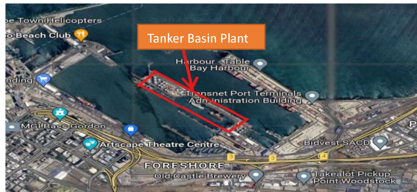
Figure 1. Tanker Basin plant

The Tanker Basin plant is situated in the Eastern Mole precinct as shown below.