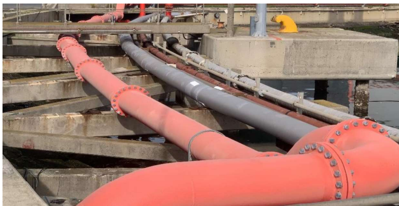
Figure.3 shows a 52m pipe long

The Tanker Basin plant is used to dock petroleum vessels. There are Tank terminals for FFS Refiners that are stored within the plant and they transport the liquid substance through piping. Part of the Firefighting system pipe network is installed above ground level as well as other pipe network situated above sea levels as shown below: