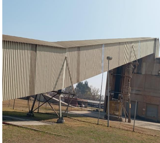
4) Lime Plant no.2 Eastern Side B