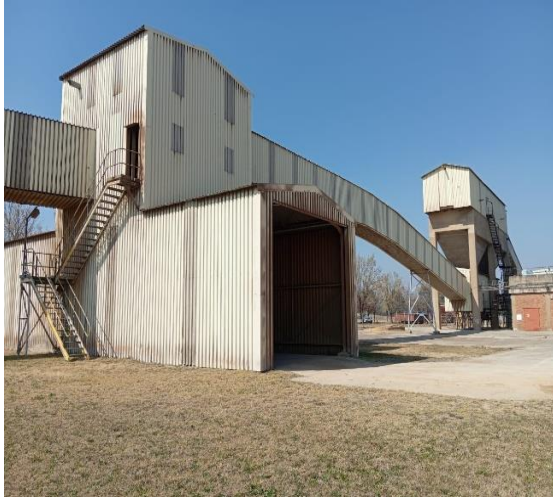
3) Lime Plant no.2 Eastern Side A