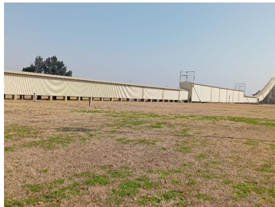
8) Slaker House no.3 Opposite Parking