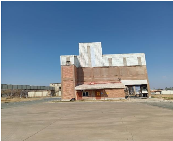
5) Lime Plant no.2 Crossing the Road