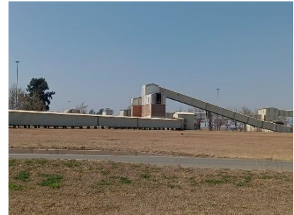
9) Slaker House no.3 Opposite Systems 3