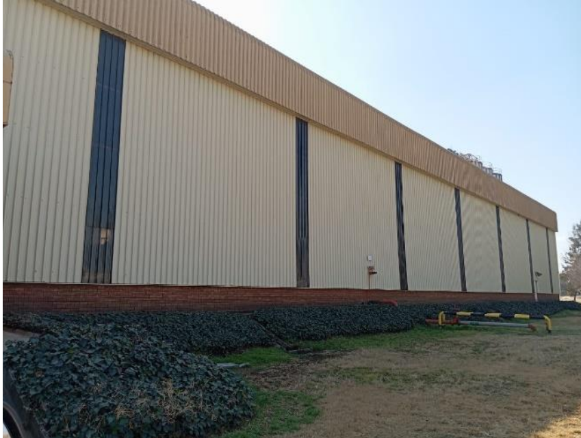
12) PAC Plant Western Side

The highest height is 20 meters, therefore.