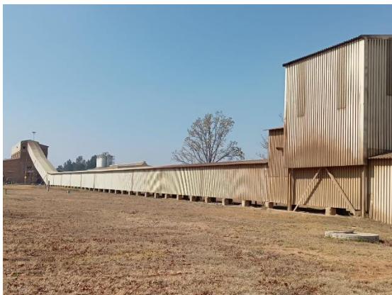
7) Slaker House no.4