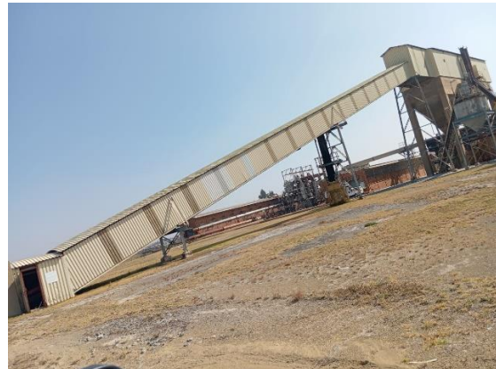
2) Lime Plant Second Structure