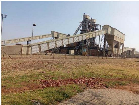
1) Lime Plant Entrance Structure