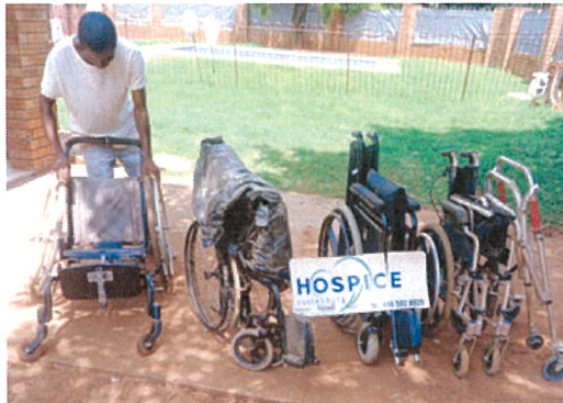
A gift of mobility — five wheelchairs donated to Hospice Rustenburg will provide comfort to patients, with one available for hire to support future care initiatives.