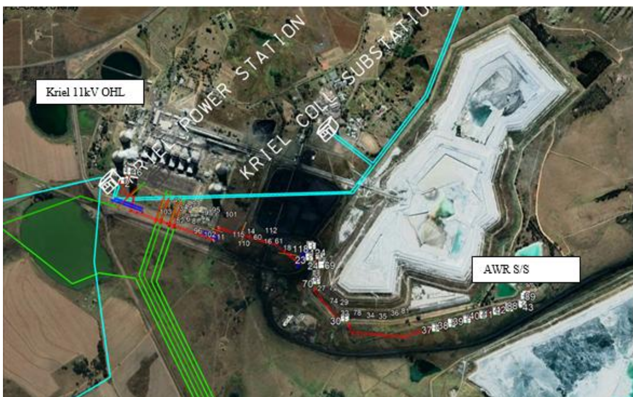
Figure 1: Kriel Power Station proposed 11 kV routing.

The routing for the 11 kV line is colour coded Red in the figure below.