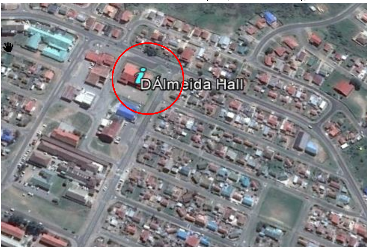
Figure Error! No text of specified style in document.1: D'Almeida Community Hall

GPS: 34°10'29.884"S 22°07'05.881"E - D'Almeida Community Hall (D'Almeida, Mossel Bay)