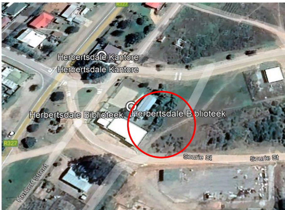
Figure 7: Library (Herbertsdale)

GPS: 34° 1'4.38"S 21°45'43.76"E - Library (Herbertsdale)