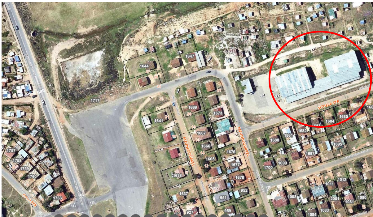
Figure 9: Barcelona Office

GPS: 34°10'09.98"S 22°05'27.41"E - Barcelona Offices (KwaNonqaba, Mossel Bay)