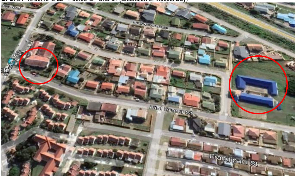
Figure 5: School - Church (Extension 6, Mossel Bay)

GPS: 34°10'36.19"S 22° 7'36.88"E - Church (Extension 6, Mossel Bay)