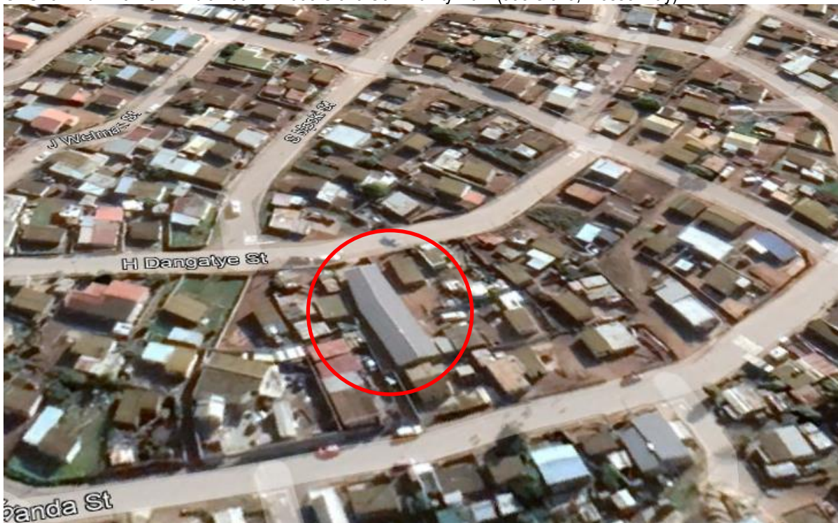
Figure Error! No text of specified style in document.4: Joe Slovo Community Hall

GPS: 34°10'14.37"S 22° 6'54.59"E - Joe Slovo Community Hall (Joe Slovo, Mossel Bay)