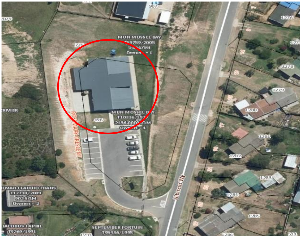
Figure Error! No text of specified style in document.6: Youth Centre (Great Brak River)

GPS: 34° 02' 20.9385"S 022° 12' 38.9533"E – Youth Centre (Great Brak River)