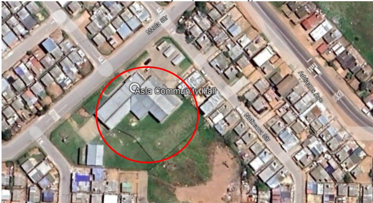
Figure Error! No text of specified style in document.8: Asla Community Hall

GPS: 34°10'48.23"S 22° 4'7.47"E - Asla Community Hall (Asla, Mossel Bay)