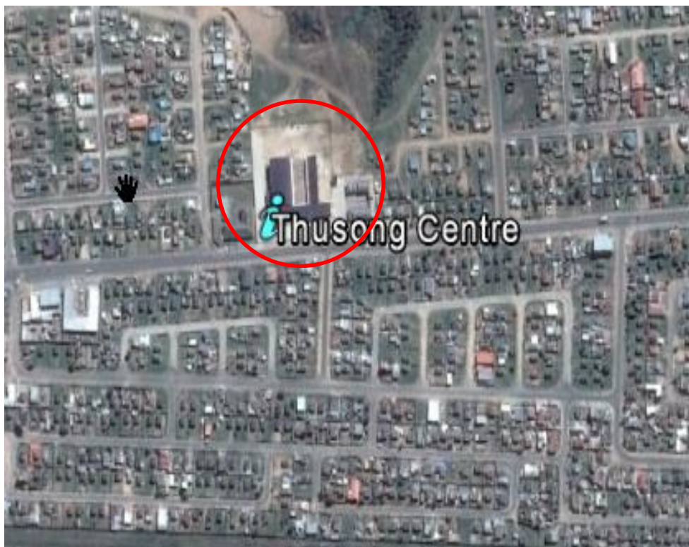
Figure 3: Thusong Centre (Kwanonqaba, Mossel Bay)

GPS: 34°10'46.207"S 22°04'46.1"E - Thusong Centre (Kwanonqaba, Mossel Bay)