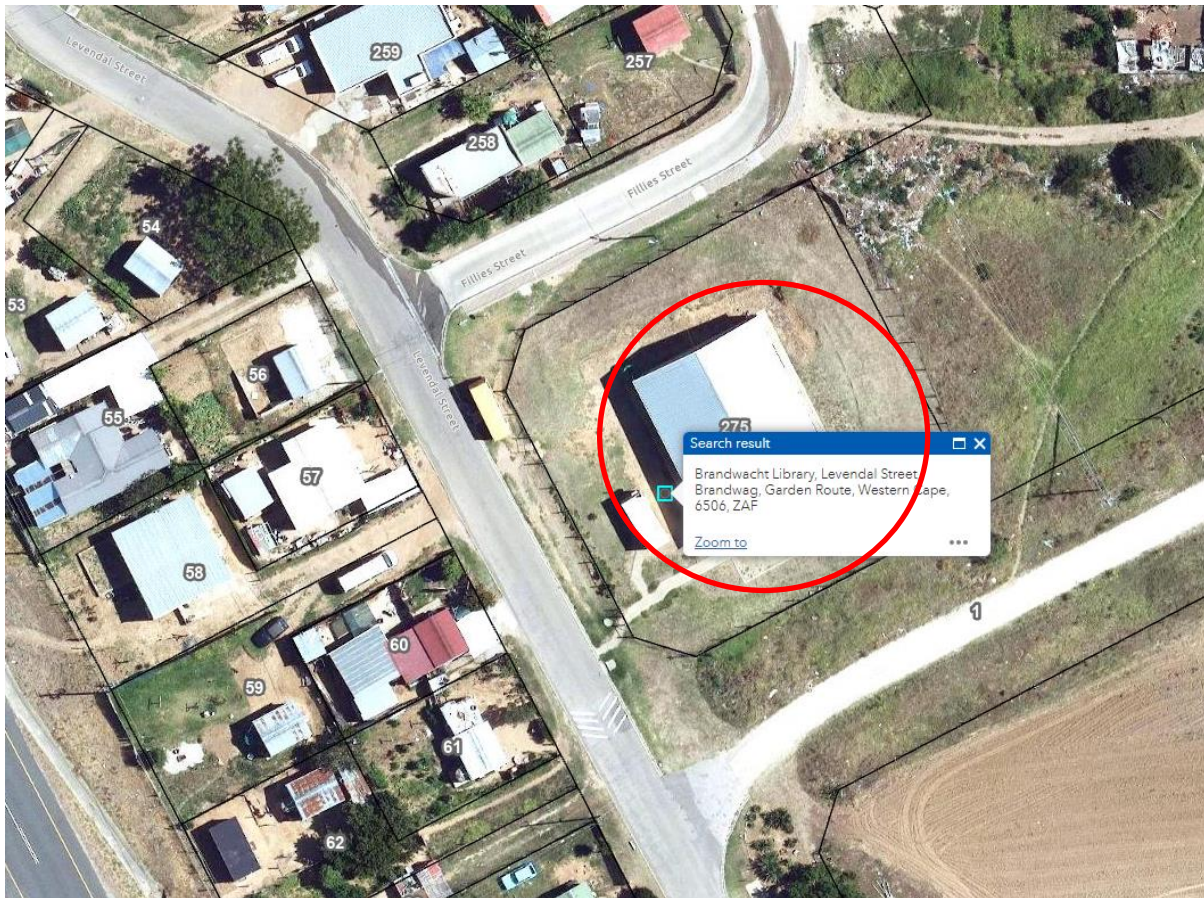
Figure Error! No text of specified style in document.10: Brandwacht

GPS: 34°03'04.57"S 22°05'28.88"E - Brandwacht