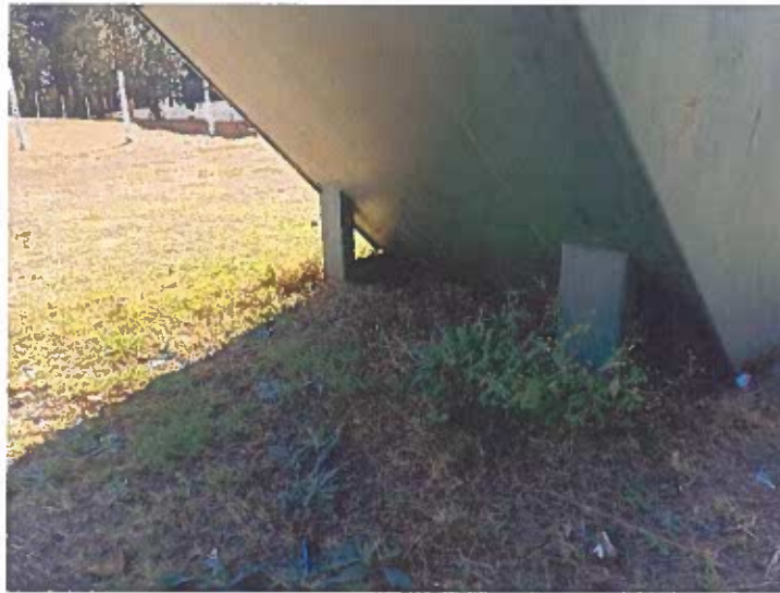
See attached ground stability structure of bulk bin