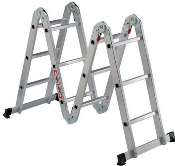
Figure 1: Aluminium Multi Purpose Folding Ladder

iThemba LABS requires an Aluminium Multi-Purpose Folding Ladder to the following specification: