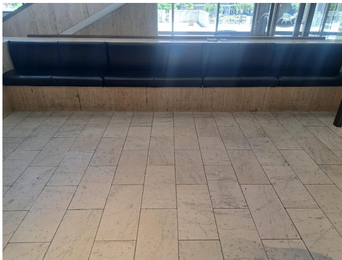
Fixed seating / benches in Marble foyer

Fixed seating in the Theatre Lower foyer only has a seat with no backrest as can be seen on the image “Fixed seating in the Theatre lower foyer” below.