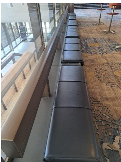
Fixed seating / benches in Theatre lower foyer

Fixed seating in the Theatre Lower foyer only has a seat with no backrest as can be seen on the image “Fixed seating in the Theatre lower foyer” below.