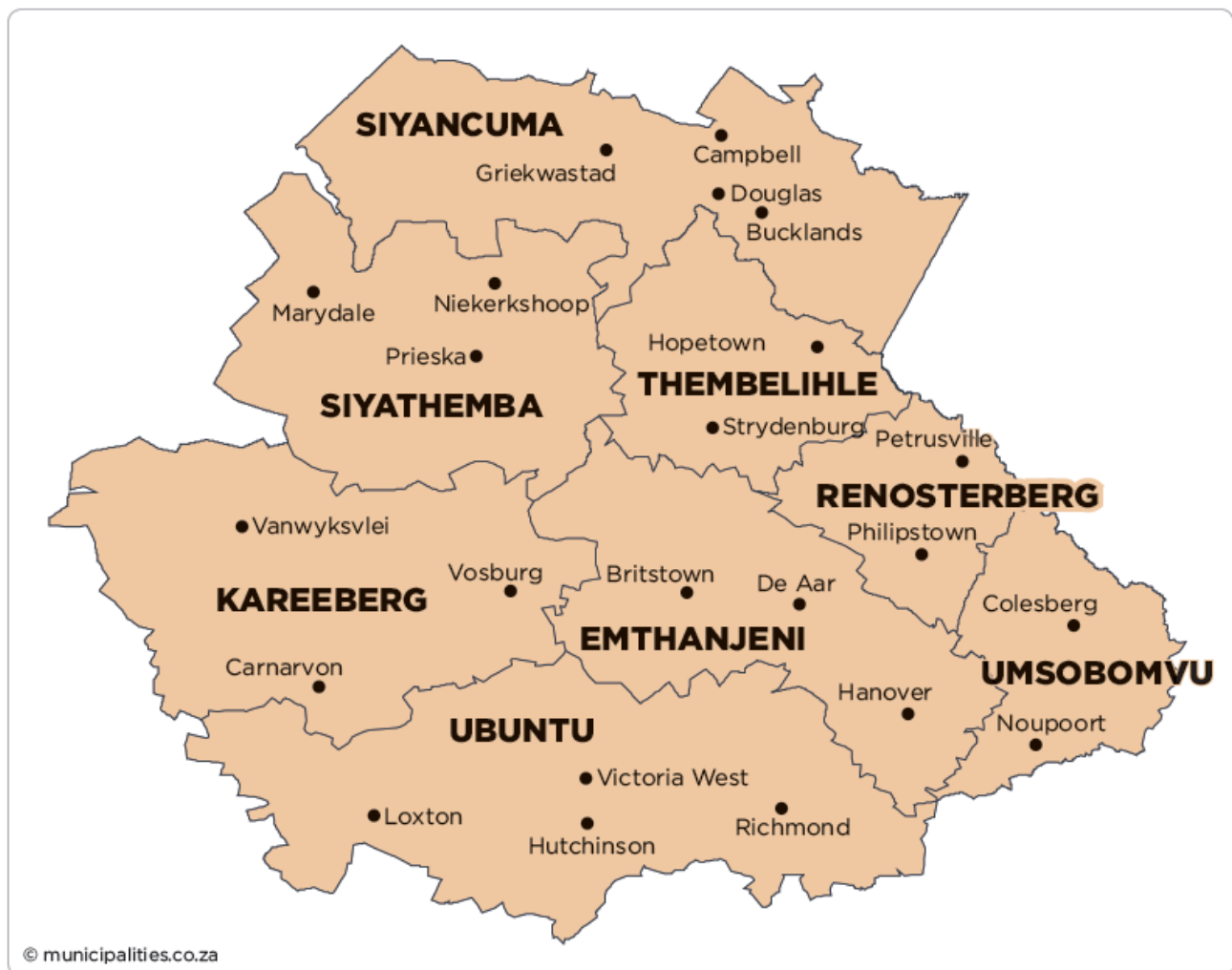
Figure C3.4.1 Locality - Prieska

The locality map for the area is shown in the figure below: