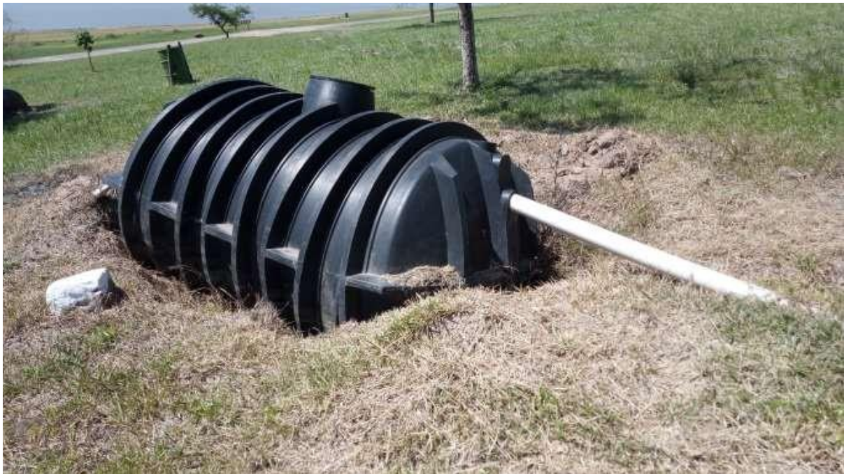
Figure 1: 5000 litres plastic septic tanks required