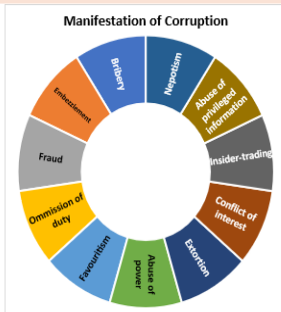
Figure 1: Manifestations of corruption