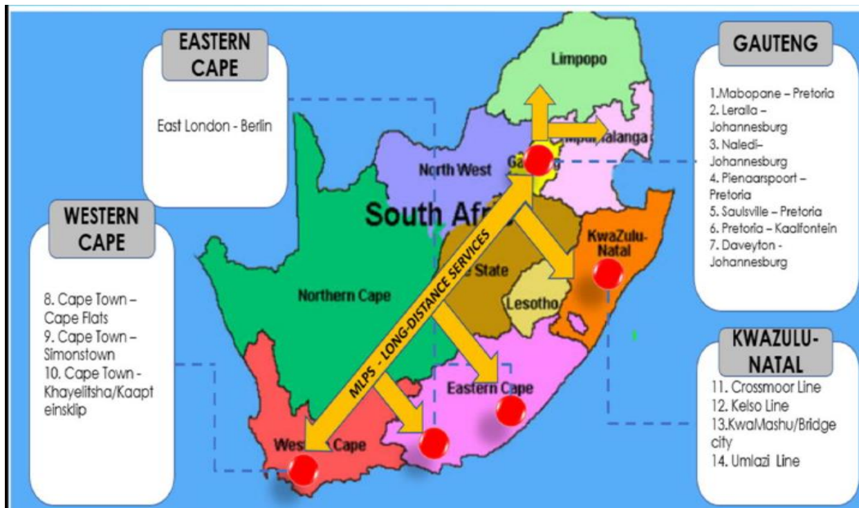
Figure 1: National Corridor Diagram

The 15 corridors (including Gauteng Region) are as below pictorials: