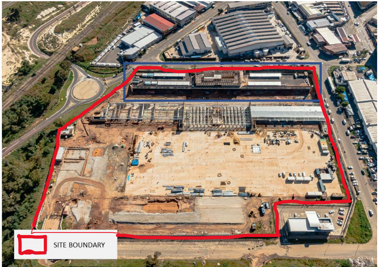
Figure 1- Selby depot footprint