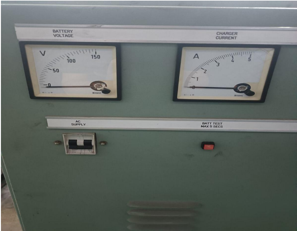
Picture 2. 110 VDC Amp meters and Volt meters