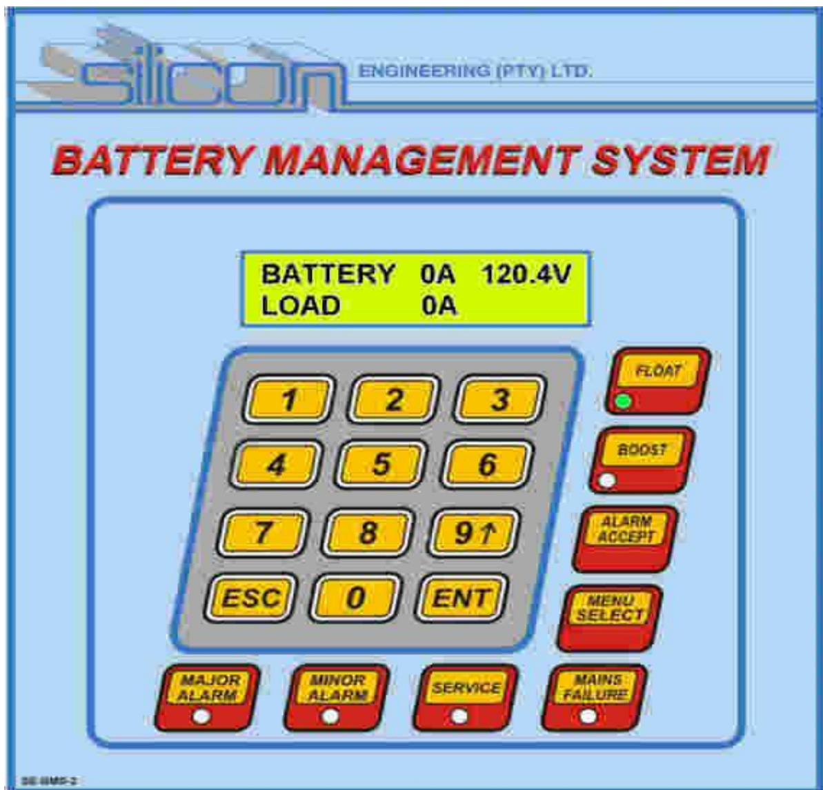
Picture 1. Battery Management System