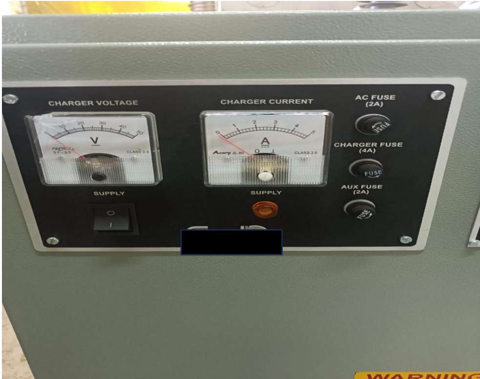
Picture 3. of 32 VDC, Amp meters, fuses and Volt meters.