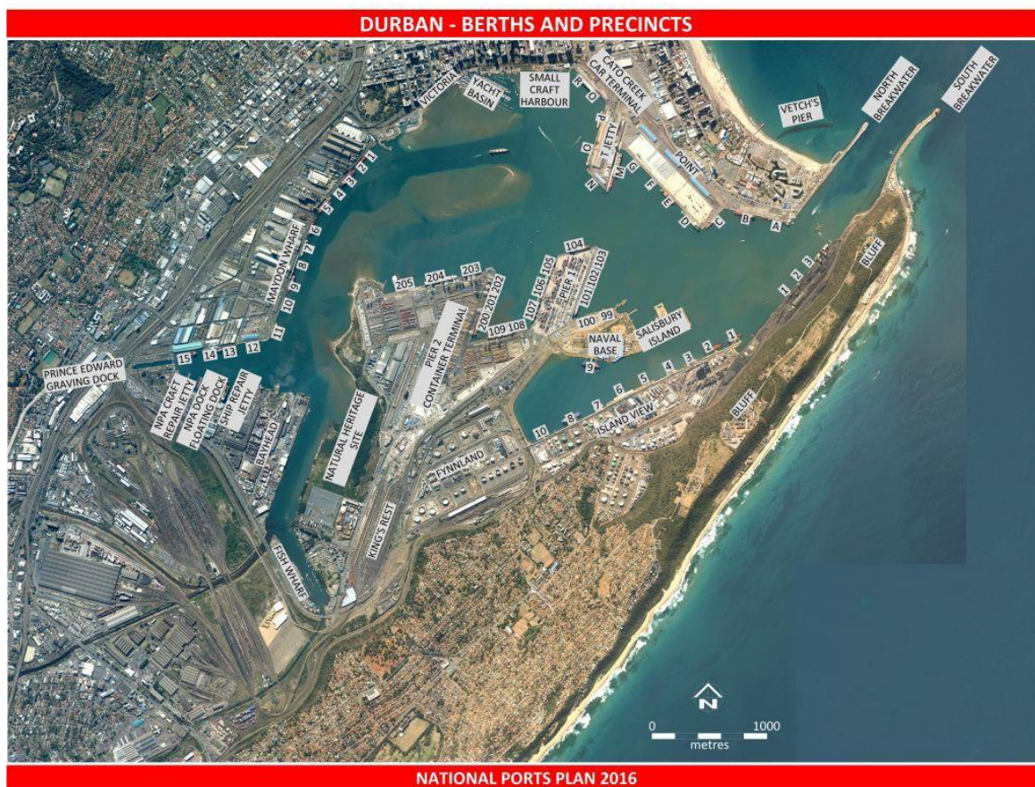
Figure 1: Precincts and berth layout of the Port of Durban

The layout of the port, indicating the precincts and berth layout, is presented in Figure 1. Within the precinct there are roads which are leading to different terminals and buildings. Site owned and operated by TNPA