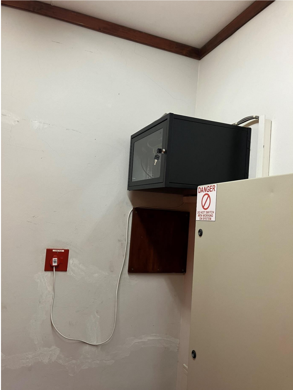
LV Room LAN 19" Rack