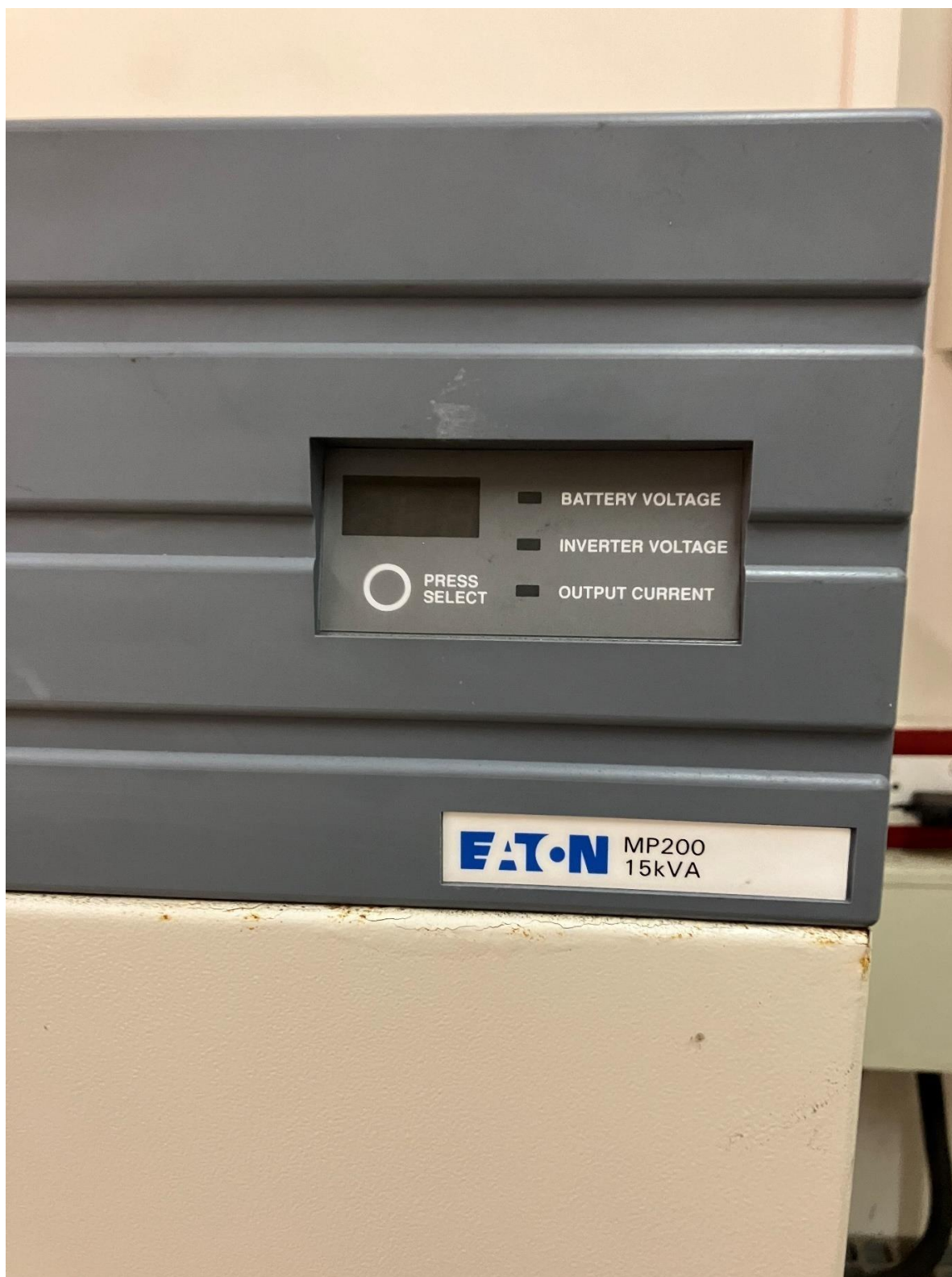
Faulty Eaton 15 kVA UPS in LV Room