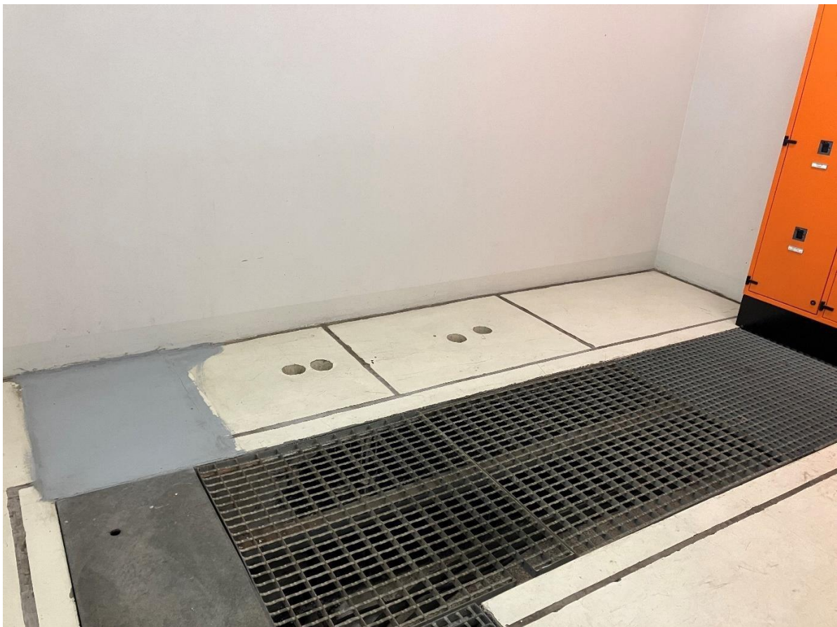
LV Room View 2