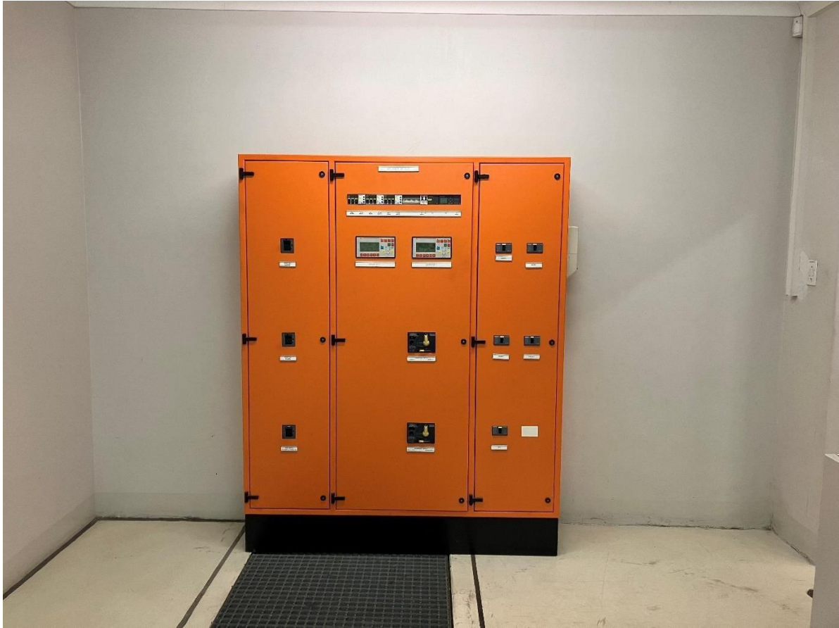
LV Room View 3