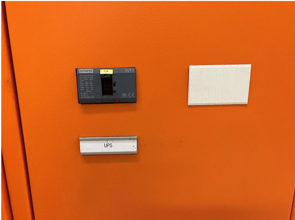
UPS A Breaker with Space for Second UPS B