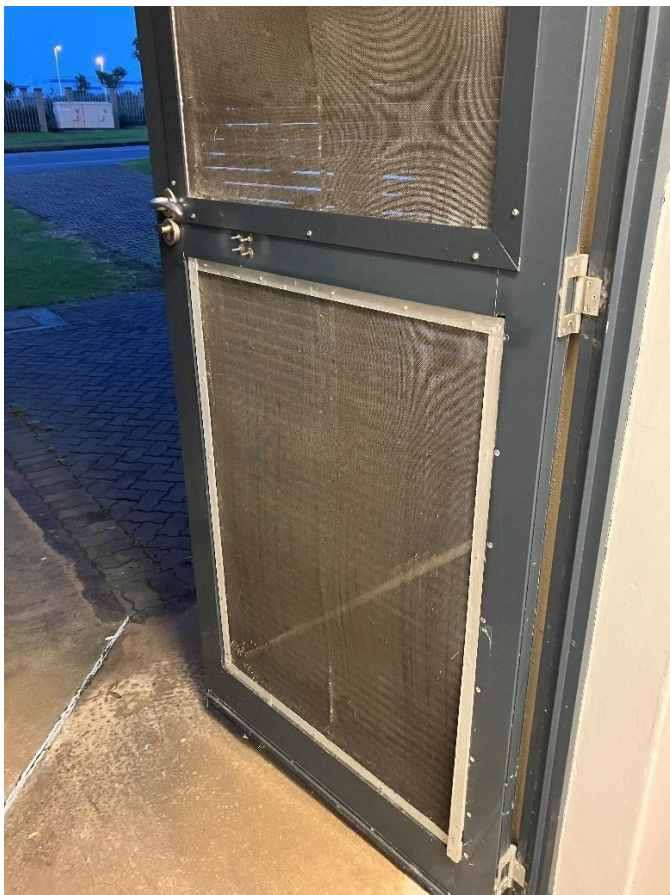
LV Room View 4