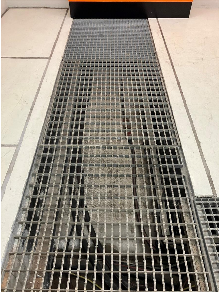
LV Room View 5