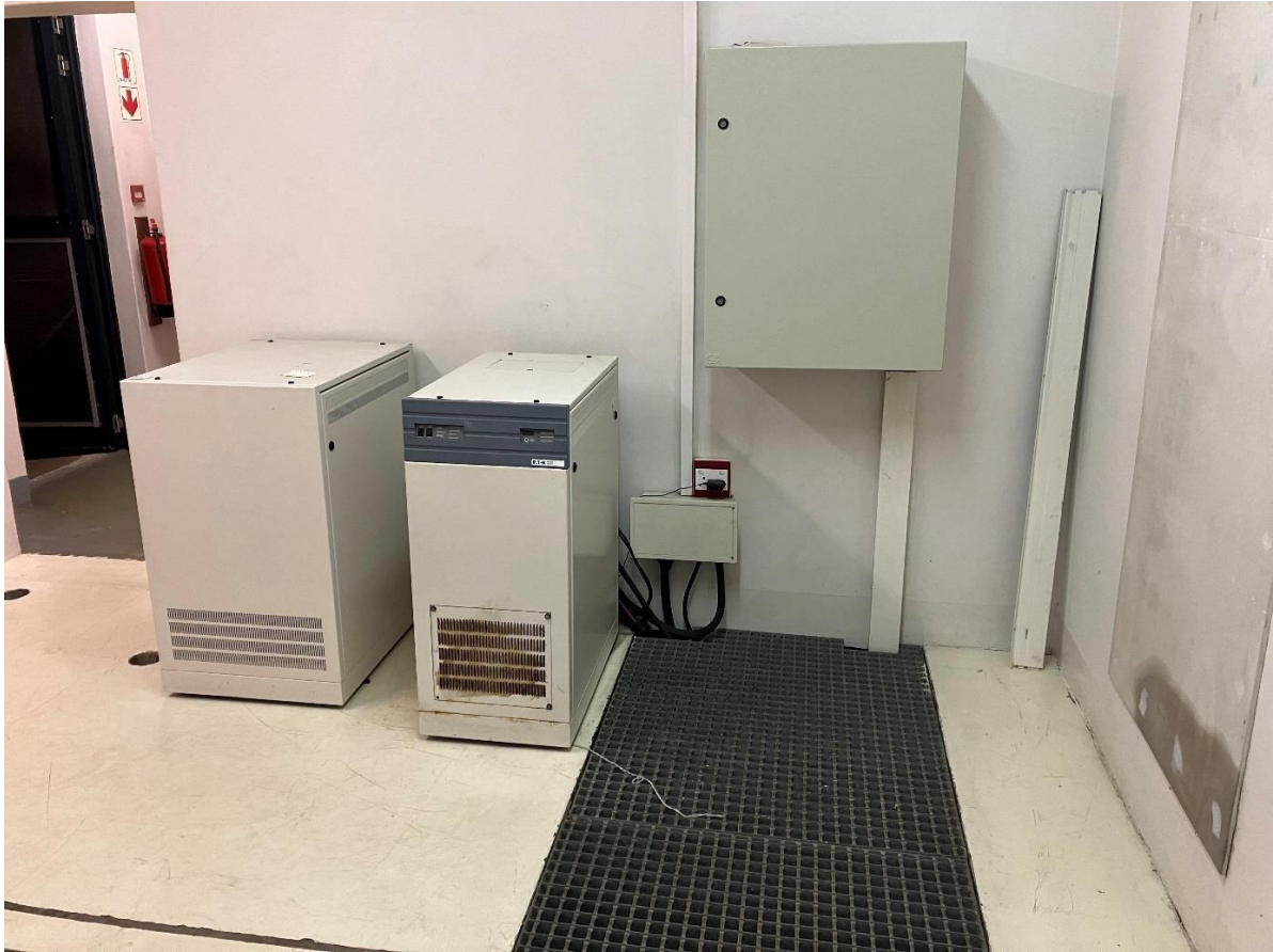
LV Room View 1