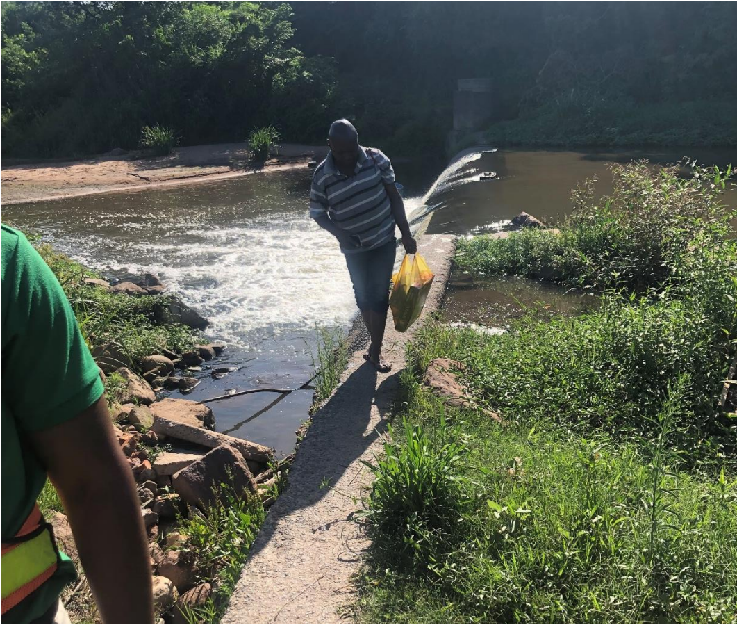
Figure 2: A community member using a sewer line to cross Umhlathuzana River.