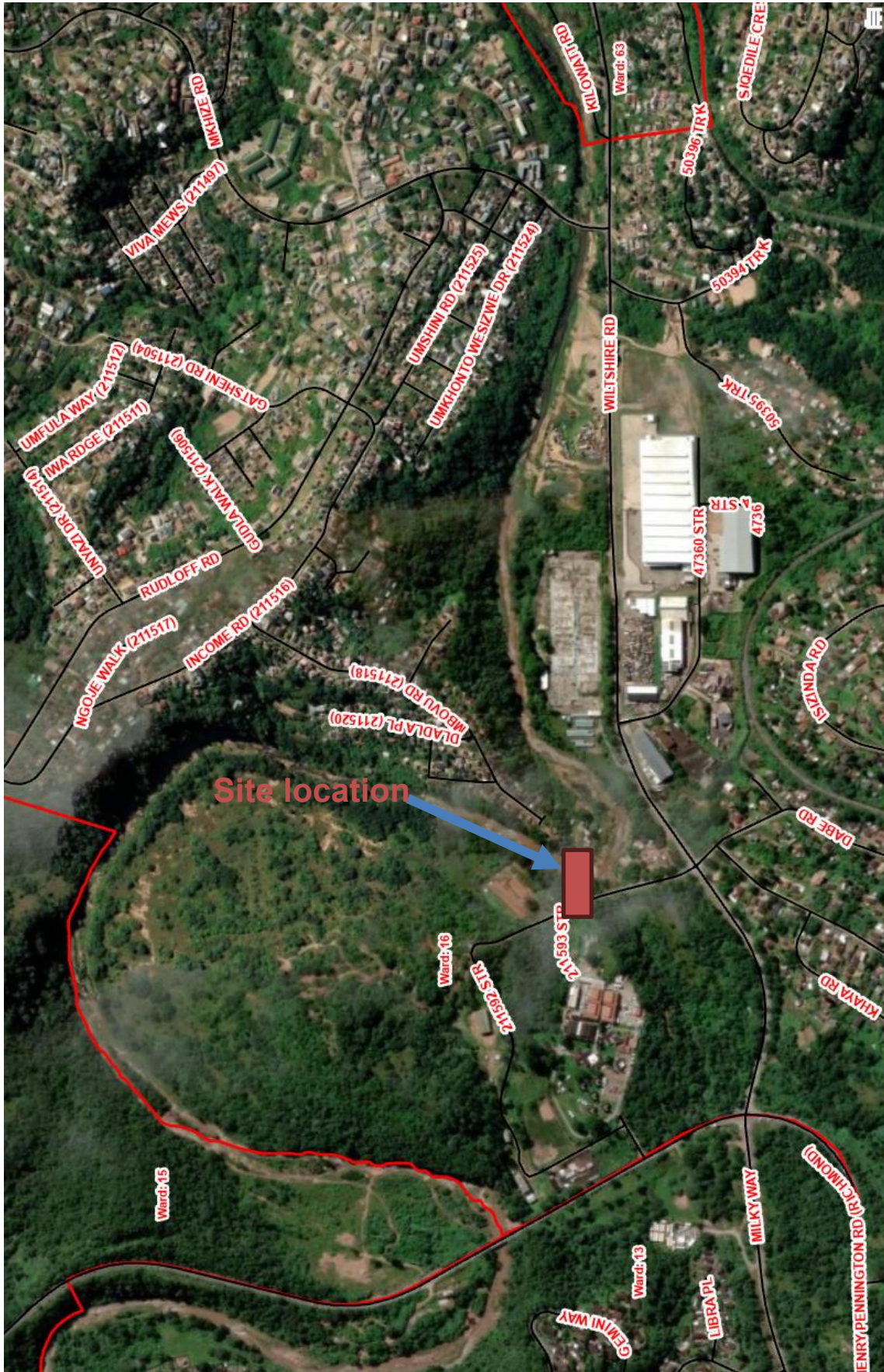
Figure 1: illustrate a site location on the GIS picture scale 1:7'144