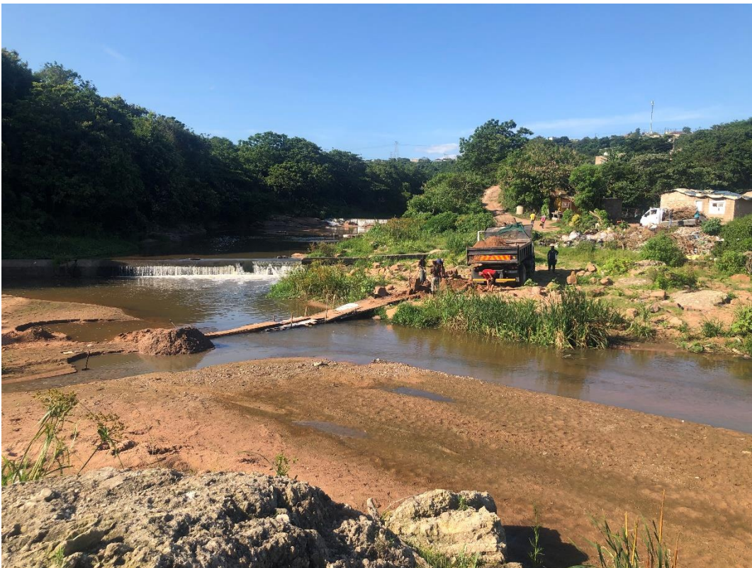
Figure 3: upstream of the Umhlathuzana River and illegal sand mining