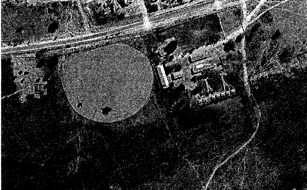
Figure 1: Locality

The proposed site is located in Vhulaudzi Village some thirty seven kilometers (37km) north east of Louis Trichardt, in the Limpopo Province of South Africa. Coordinates: -24.216672S, 30.506583E.