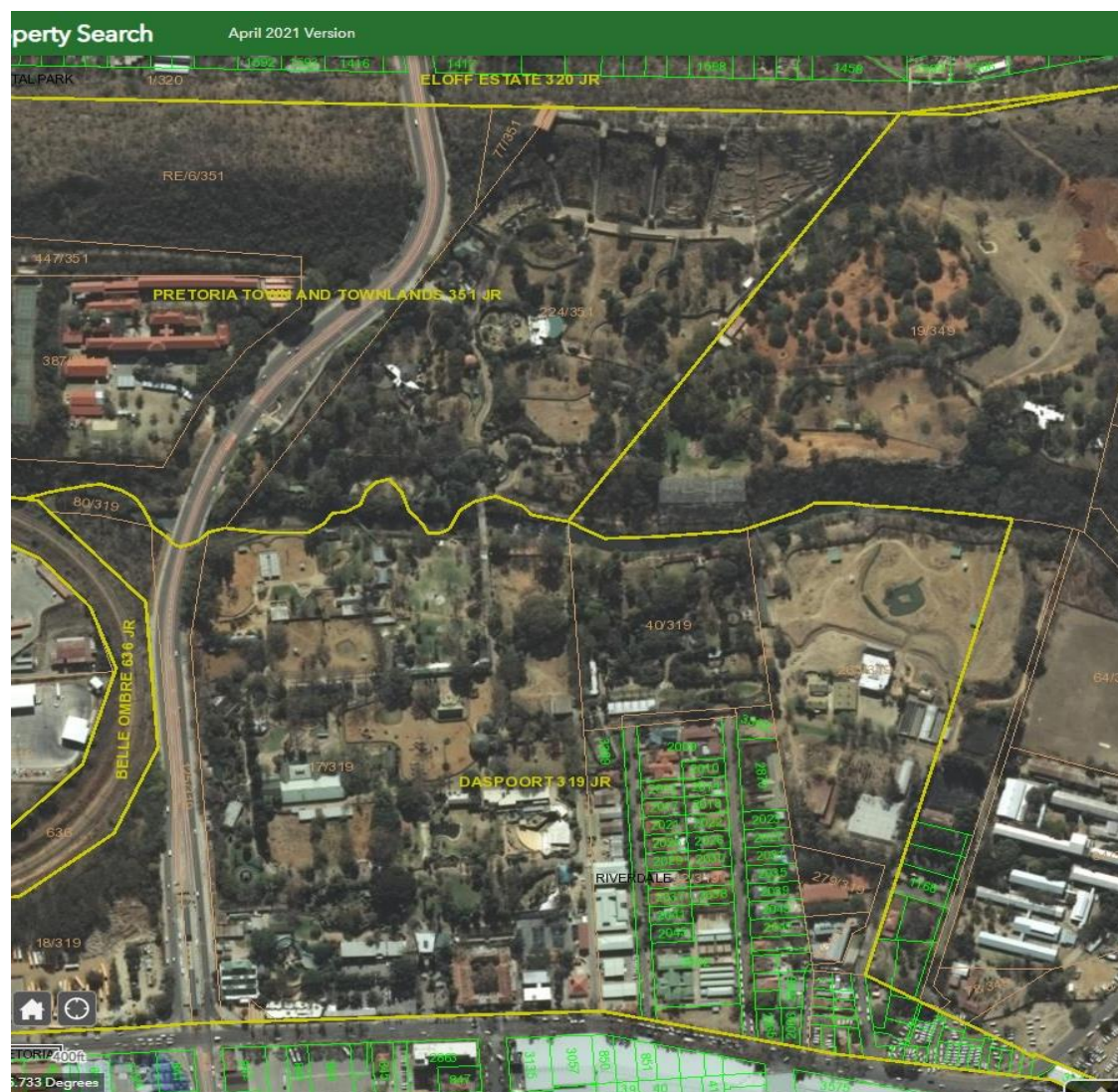
FIGURE 1: SITE LOCALITY PLAN - AERIAL PHOTO FROM CSG SHOWING CADASTRAL LAYOUT OF THE NZG

The proposed construction is to take place within the National Zoological Garden in Pretoria.