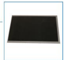
7.0 Inch LCD Screen