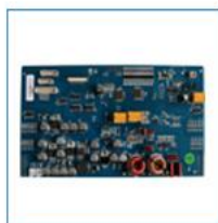
Integrated Circuit Board