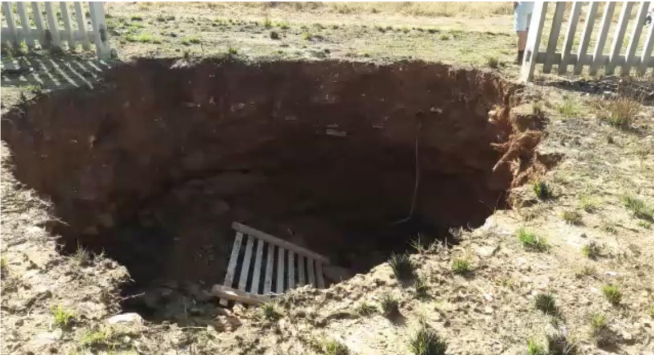
Figure 1: Sinkholes indicate that material has been washed out of the fill below the surface and the overlying material is collapsing into the space. Sinkholes can be small at the surface but may indicate a large cavern below. Sinkholes are also indicators that surface water is not controlled and is getting into the embankment fill and may soften the fill. Sinkholes may also indicate that there could have been timber below the surface that has begun to rot or old sub-surface rubble drains.