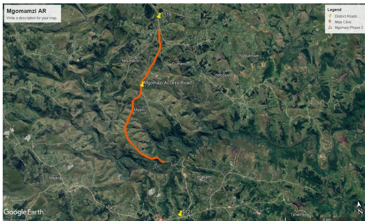
Figure 1: Existing Mgomamzi access road to be rehabilitated.

Mgomamzi Access Road is accessible via T121 from R61. From Mbizana town head southeast on R61, at approximately 3km turn right onto T121 to the start of Mgomamzi Access Road (end of T121).