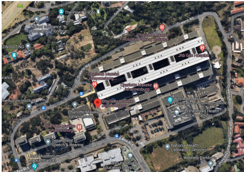
Figure 1: Aerial View of the Charlotte Maxeke Johannesburg Academic Hospital

GPS Co-ordinates: : -26.17395, 28.045241