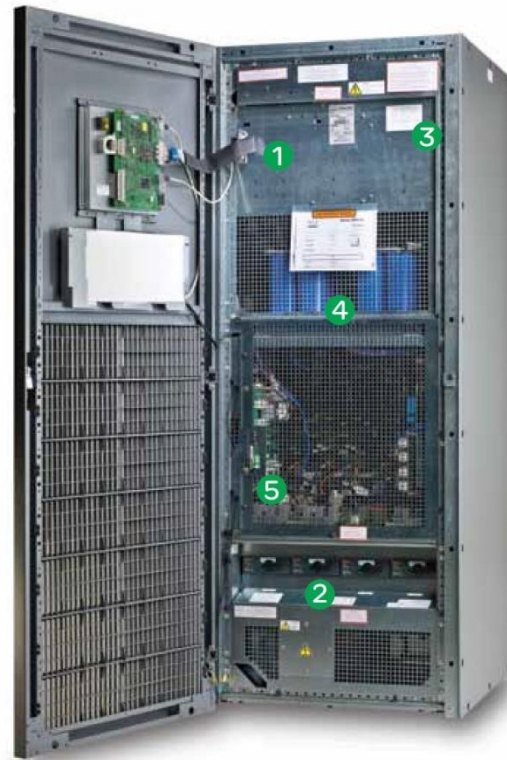
FIGURE 1: MGETM Galaxy 5000 50KVA