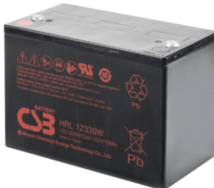
Figure2: UPS Battery