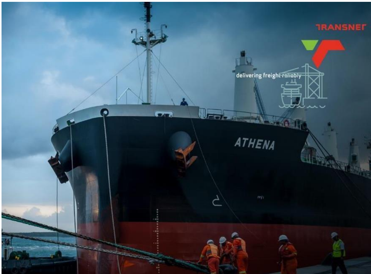
Figure 1: Transnet Cover Theme

SUPPLY OF READY-MIX CONCRETE ON AN AS WHEN REQUIRED BASIS FOR PERIOD OF THIRTY-SIX (36) MONTH AGREEMENT FOR TRANSNET SOC LTD TERMINALS RICHARDS BAY (TPT RCB)