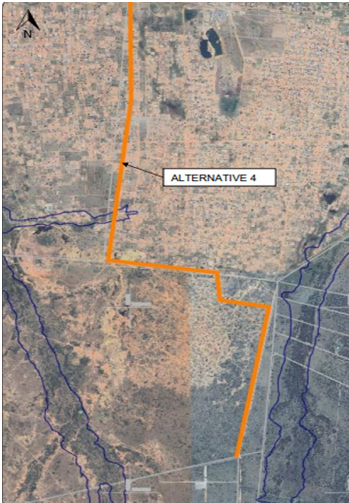
Figure 1: Proposed access road situated on the farm Tweefontein 94-JR and farm Zandkop Zyn Laagte 108-JR.