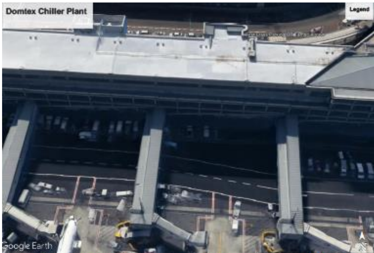
Figure 1: Domtex Chiller Plant

The water-cooled centrifugal chillers at O.R. Tambo International Airport are located at three (3) different chiller plants across the entire airport, namely (i) Domtex. (ii) KB2 Basement and (iii) Cargo. The Domtex chiller plant comprising of four (4) chillers is situated on the level 5 at Domestic Terminal. The chillers, cooling towers and chilled water and condenser pumps are located on the same floor as shown in Figure 1. The KB2 chiller plant comprising of seven (7) chillers is situated on the basement of the International Terminal. The chillers, condenser and chilled water pumps are located in the same area, whilst the cooling towers are outside the building as depicted in Figure 2. The Cargo chiller plant comprising of one (1) chiller is located on the basement of Cargo Office Building. The chiller, condenser and chilled water pumps are located in the same area, whilst the cooling tower is installed on the roof of the building as shown in Figure 3.