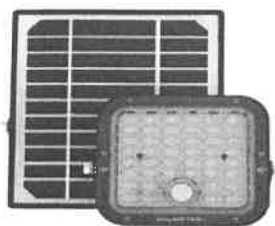
1500Lm / 10W Solar LED Floodlight - Doorphone RI-C07f