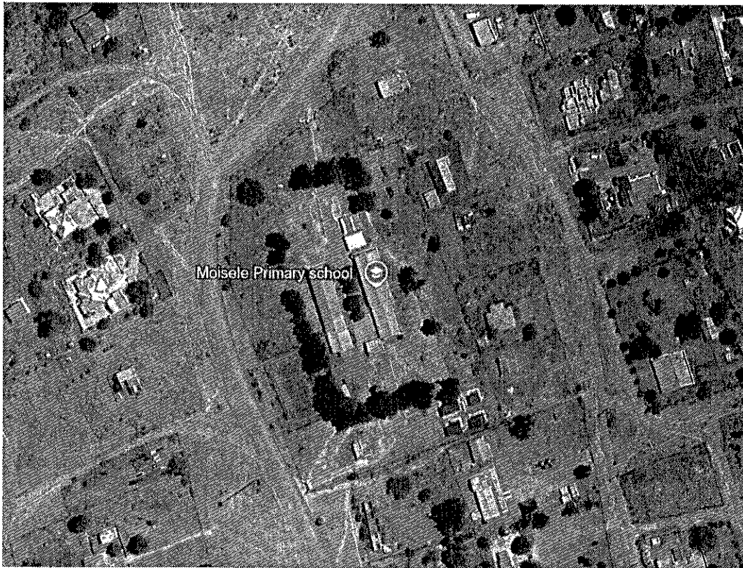
Figure 1: Locality