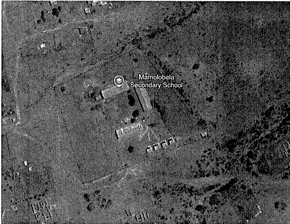
Figure 1: Locality