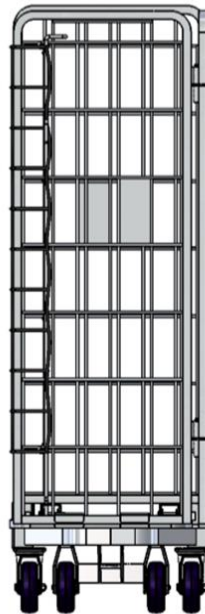
Big luggage trolley/roll tainer

Tel +27 11 723 1400 Fax +27 11 453 9354 Western Precinct, Aviation Park, O.R. Tambo International Airport, 1 Jones Road, Kempton Park, Gauteng, South Africa, 1632 P O Box 75480, Gardenview, Gauteng, South Africa, 2047 www.airports.co.za