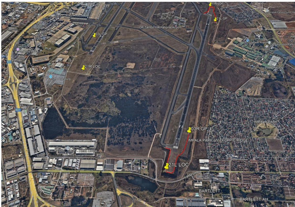
Figure 1: Location and intended footprint of the service roads

Due to the proximity of the service roads to the runway, the entire scope maybe required to be construction during the night when the runway is not active.