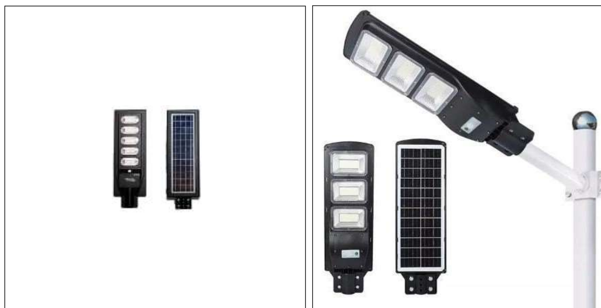
Figure 1: Example of solar led streetlights