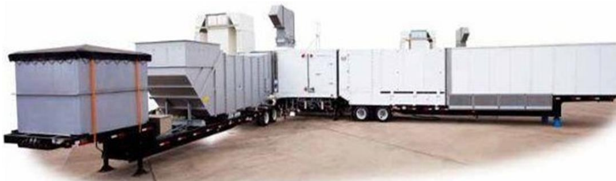
Figure 1: TM2500 Mobile Power Unit

3.1.6 The TM2500 Mobile Power Unit key product features and specifications include: