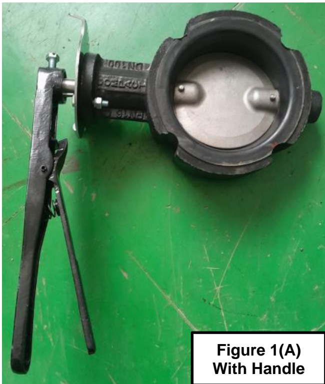
Figure 1(A) With Handle