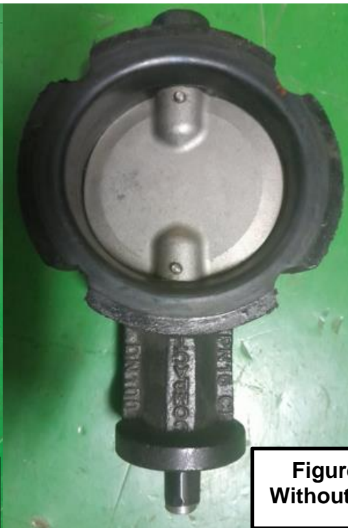
Figure 1(B) Without Handle