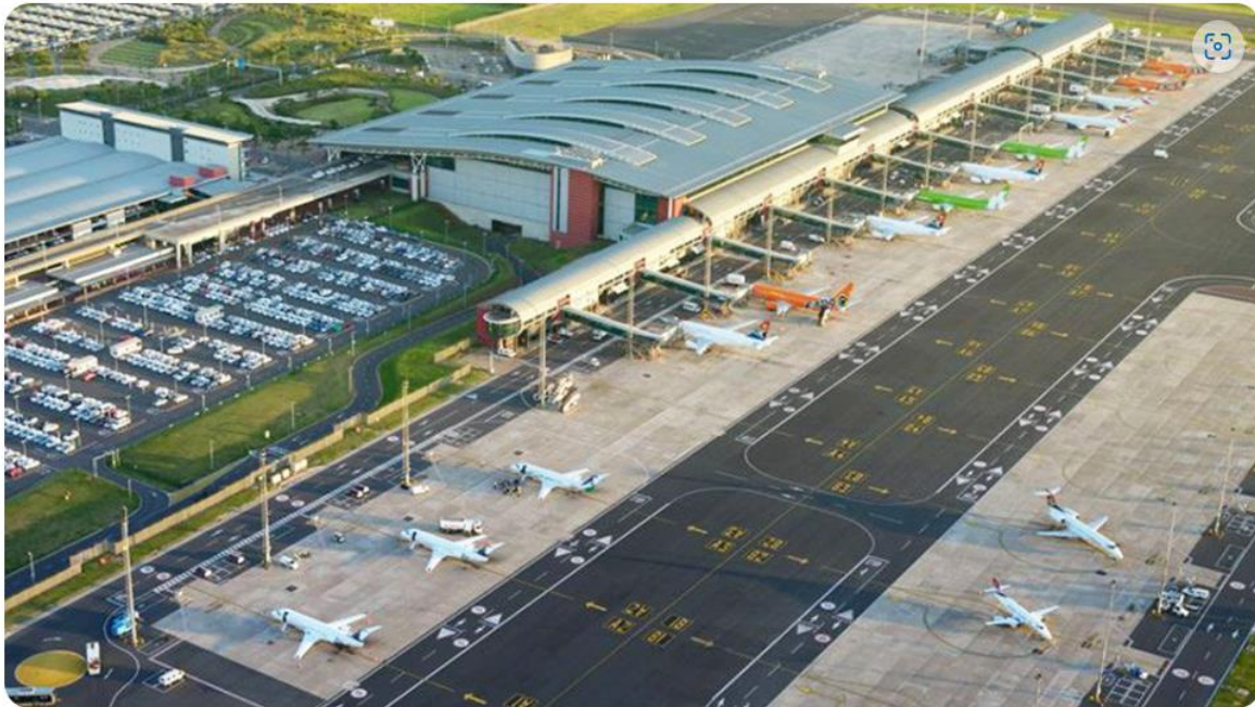
An aerial view of King Shaka International Airport

King Shaka International Airport, King Shaka Drive La Mercy 4407