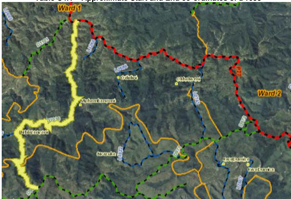
Table C4.1 – Approximate Start and End co-ordinates of D1038

The approximate limits of construction can be seen in Table C4.1 .