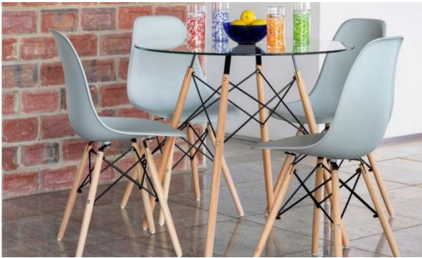
Chairs for the round table