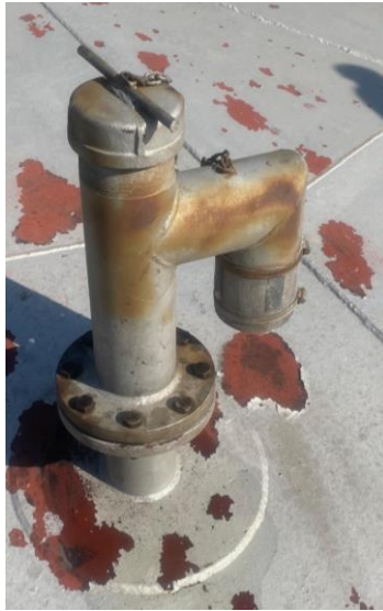
Figure 4: Vent with dip hatch