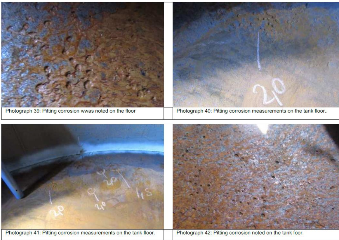
Figure 1: Internal pitting corrosion