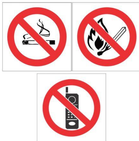
Figure 5: Safety signs