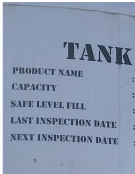
Figure 3: Tank labelling reference