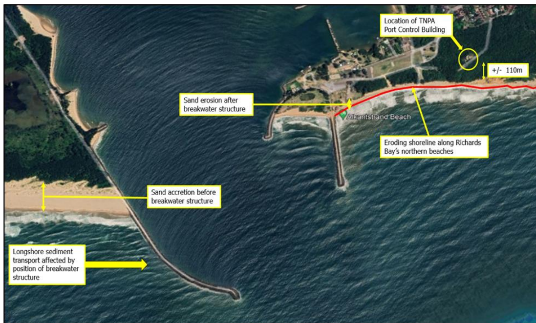
Figure 1: Alkantstrand Beach and adjacent structures

The primary challenge remains the continued erosion of the shoreline along the Alkantstrand and Northern Beaches within the TNPA Port limits, which threatens the stability of nearby structures, including the TNPA Port Control building, which is currently under construction. Severe coastal conditions hinder reclamation efforts as much of the replenished sand is washed away shortly after placement along the coastline.