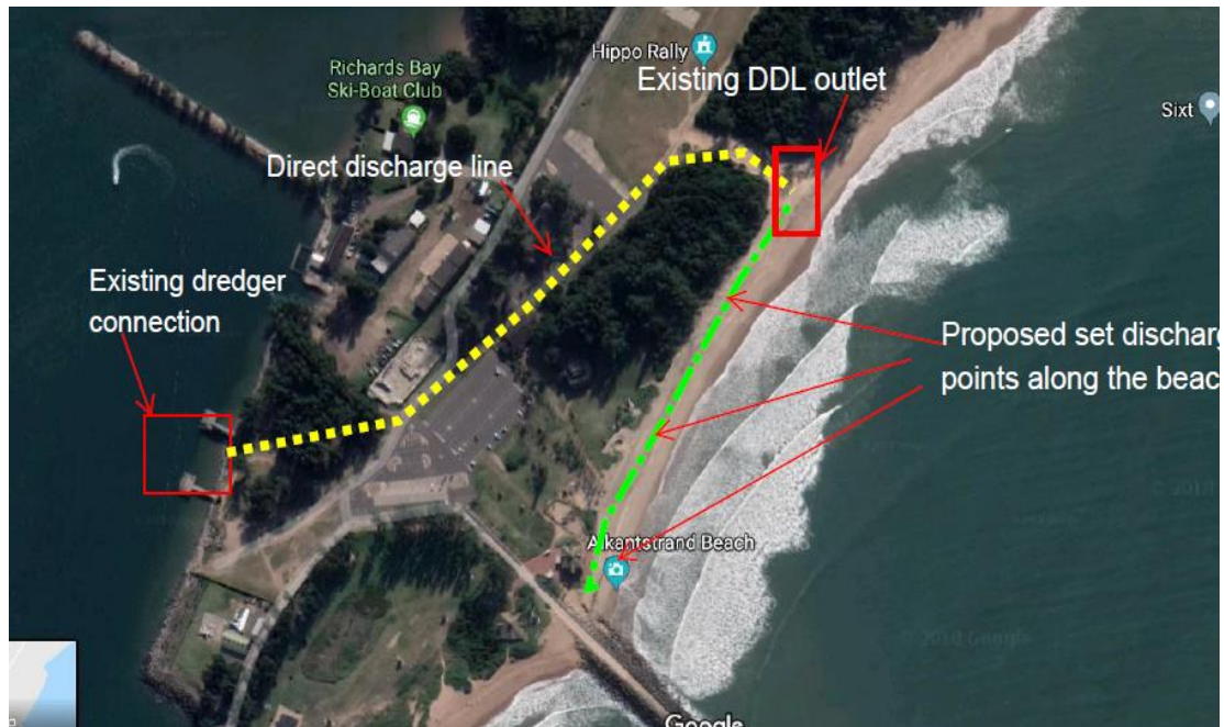
Figure 3: Proposed HDPE Extension