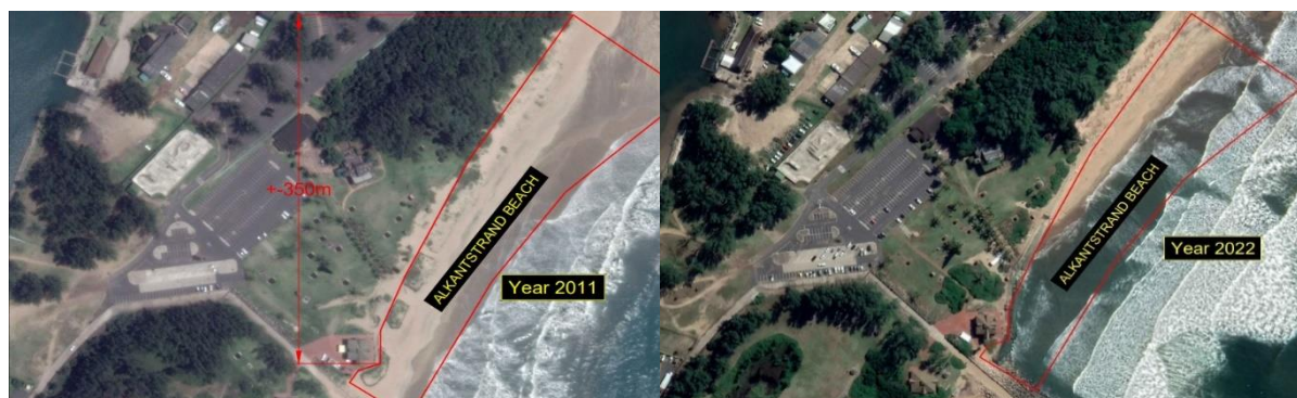
Figure 2: Receding beach width (2011-2022)