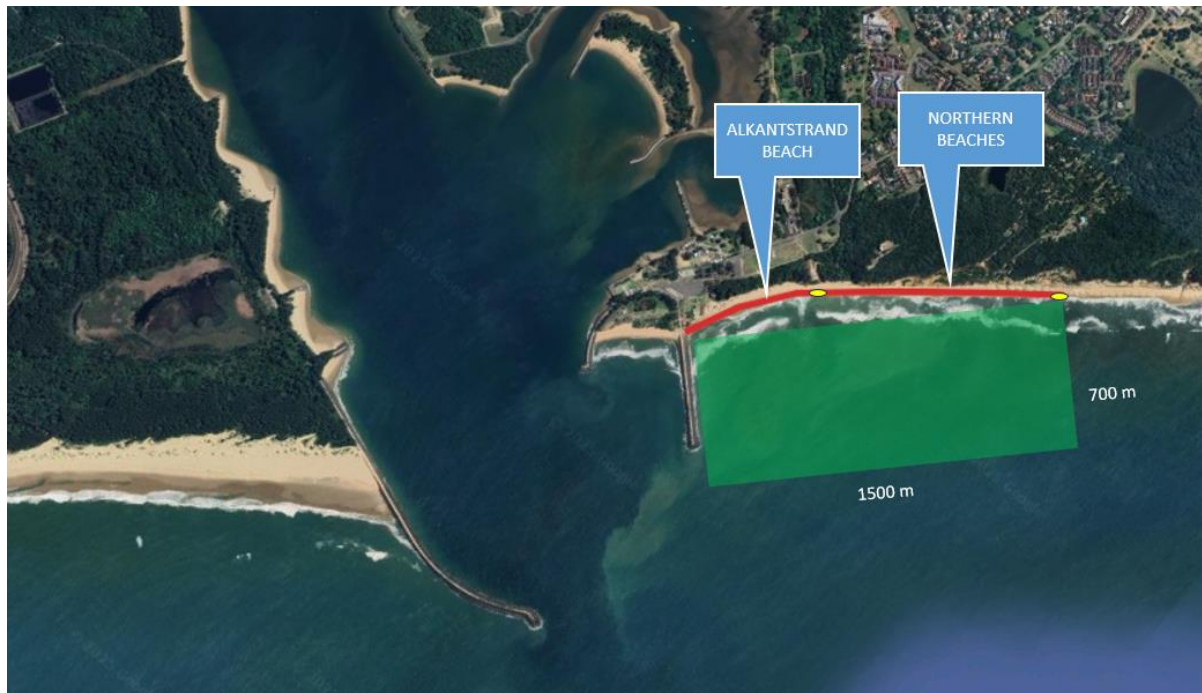
Figure 1: Study Site - Alkantstrand and Northern Beaches - Richards Bay, KZN

Figure 1 shows the site area of Alkantstrand and Northern Beaches. It shows the area of interest that extends 1.5 kilometers north of the harbour entrance and 700m seaward. The direction of the coastline is 45^{\circ} relative to north and average grain size is D_{50} = 350 \mu m .