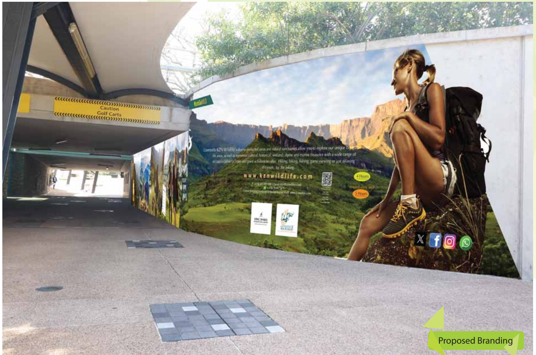
Fabric banner stretched onto metal frame