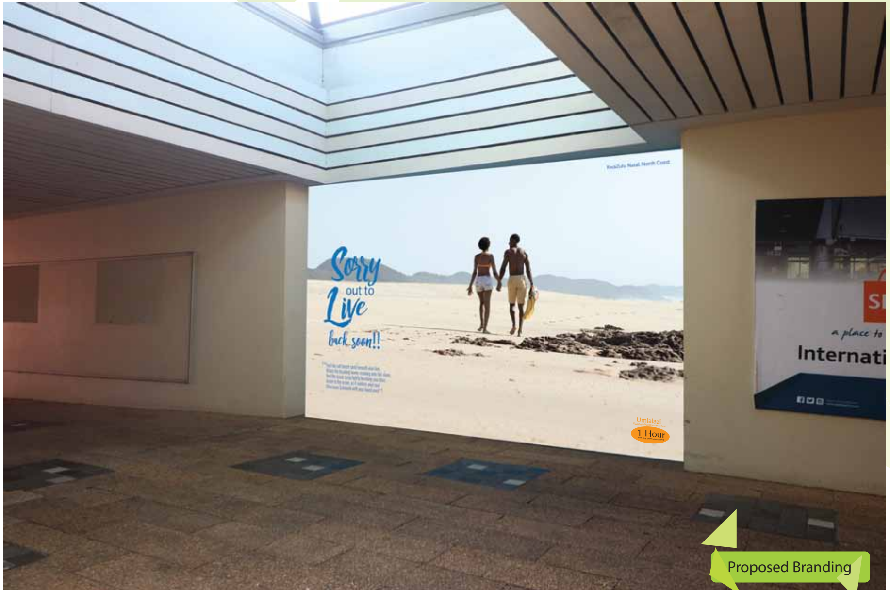
Backlit fabric banner mounted over lightbox