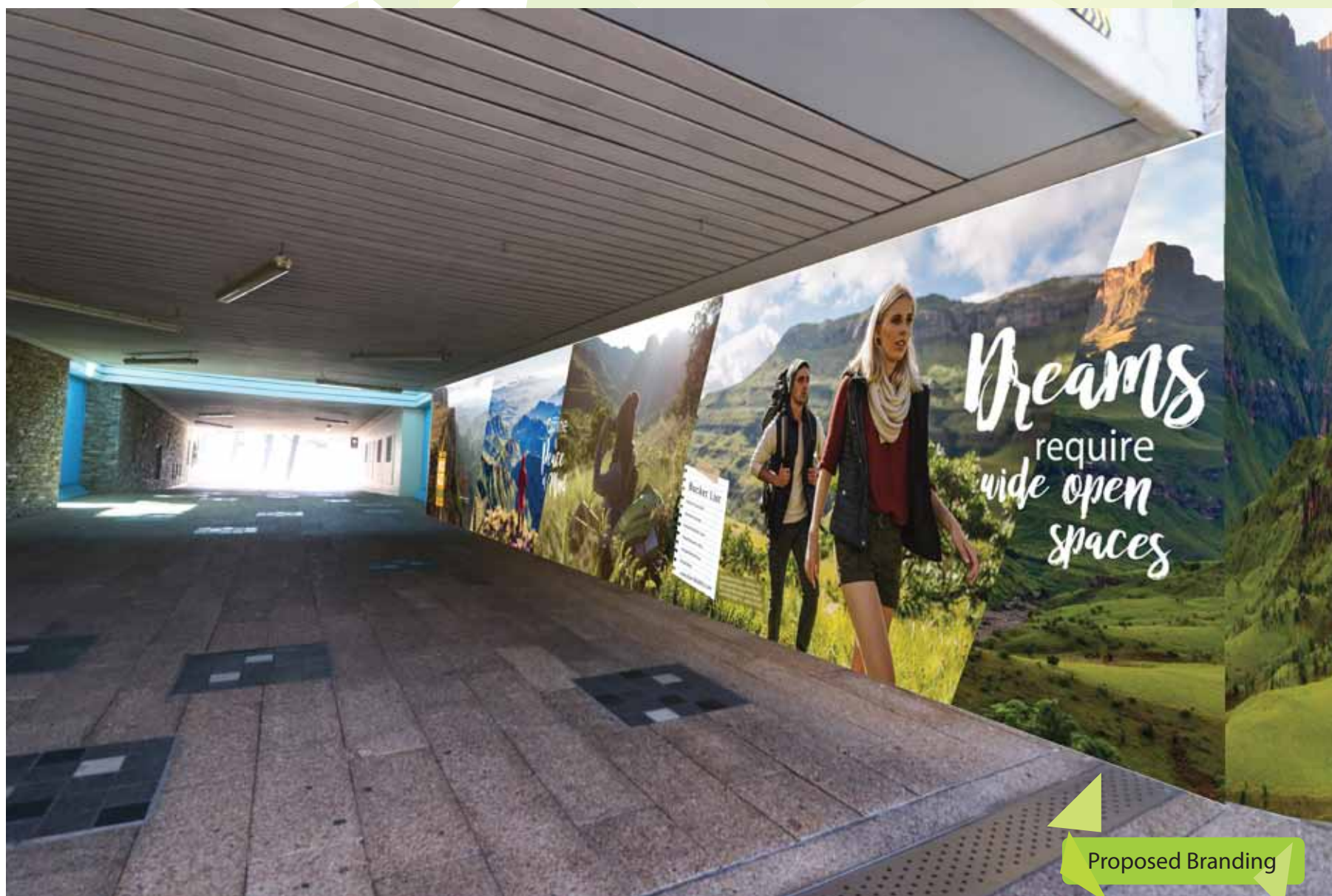
Backlit fabric banner mounted over lightbox